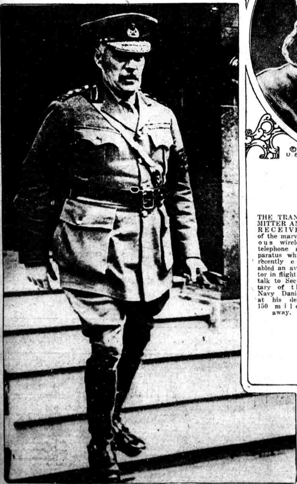
GENERAL SIR W. R. ROBERTSON, of the British army, who has been named as a successor to Field Marshal Sir Douglas Haig