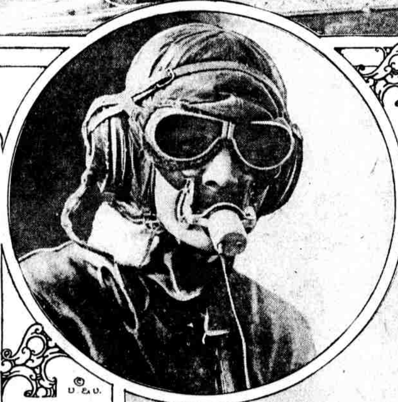
THE TRANSMITTER AND RECEIVER of the marvelous wireless telephone apparatus which recently enabled an aviator in flight to talk to Secretary of the Navy Daniels at his desk, 150 miles away.