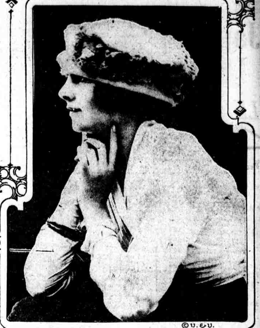
A NEAT TURBAN of light gray artistically trimmed with small ostrich plumes of the same color.