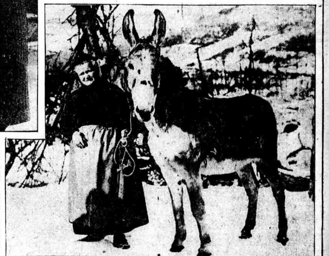
THIS DONKEY hauled this old woman to southern France when the Germans invaded her land, and now has carried her back again to Cutry, her home village, where she lives in a big cave until her little dwelling is again made habitable.