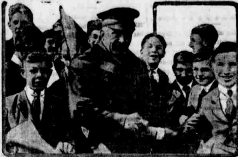
LEONARD WOOD AND HIS FRIENDS.

These boys are not afraid Leonard Wood will send them to war if he is made president, despite the gloom of the professional politician. The picture was taken in Buffalo, New York, when the Hutchinson school students overwhelmed Wood after his speech there.