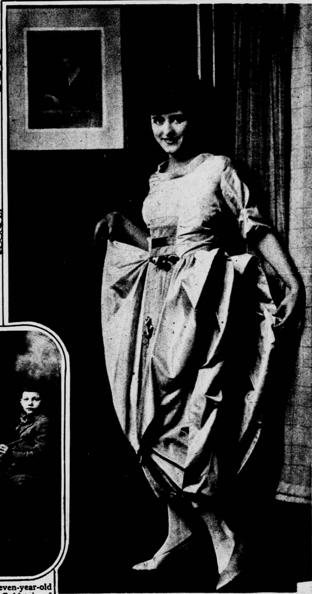
Bouffancy is the effect sought after in the newest dance frocks. This charming dress is designed of Nile green taffeta combined with lace. Tiny bunches of fruit are an added attraction.