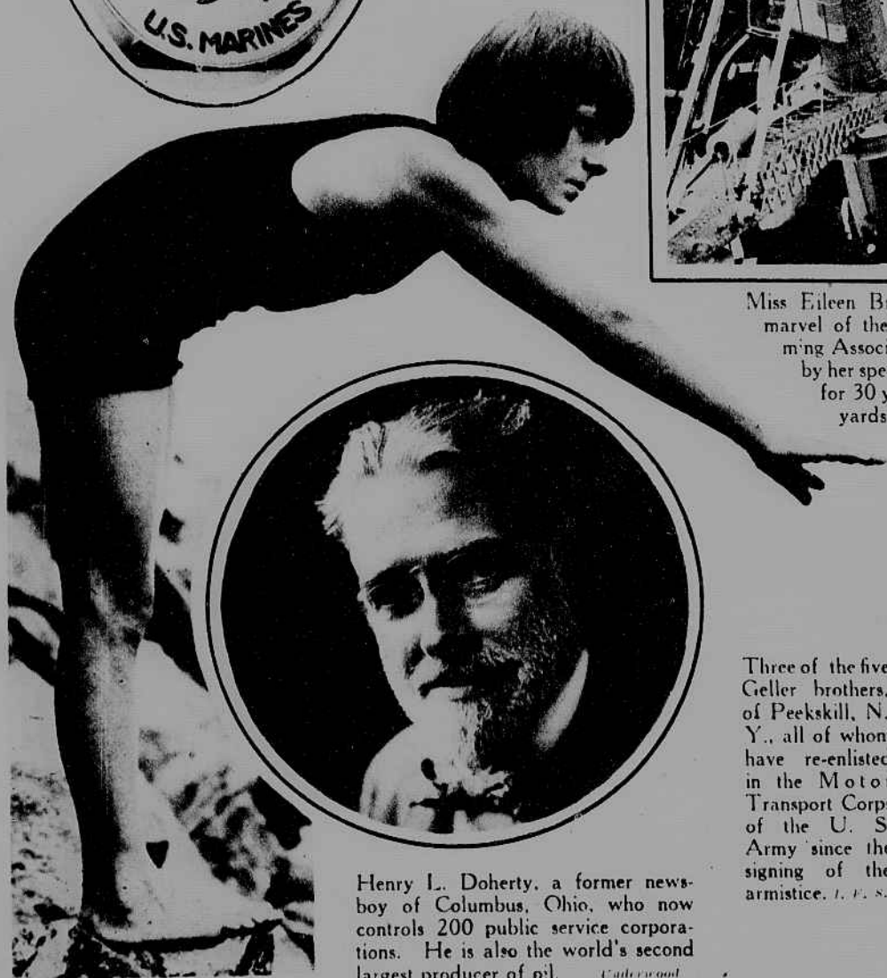
Henry L. Doherty, a former newsboy of Columbus, Ohio, who now controls 200 public service corporations. He is also the world's second largest producer of oil.