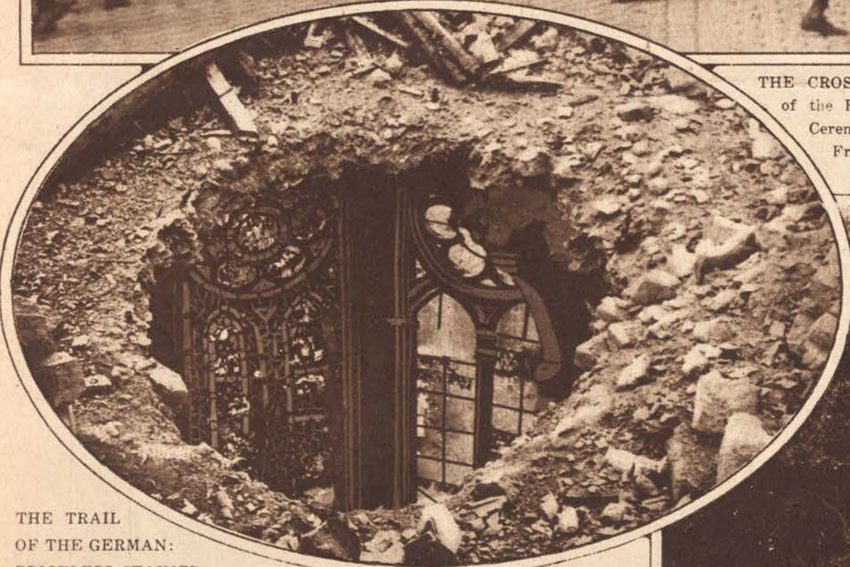
THE TRAIL OF THE GERMAN: PRICELESS STAINED GLASS WINDOWS OF RHEIMS CATHEDRAL AS SEEN THROUGH A SHELL HOLE IN THE ROOF OF THE RUINED EDIFICE. (Mirzoeff.)