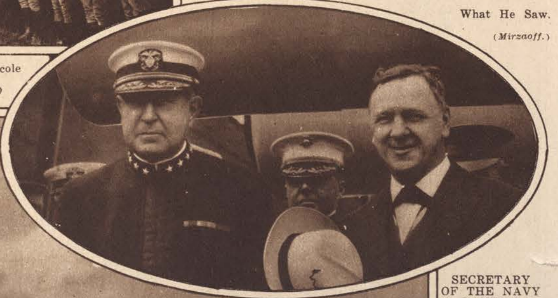
SECRETARY OF THE NAVY DANIELS AND ADMIRAL RODMAN, COMMANDER OF THE PACIFIC FLEET, RECEIVING CITIZENS OF SAN DIEGO ON BOARD THE FLAGSHIP NEW MEXICO.