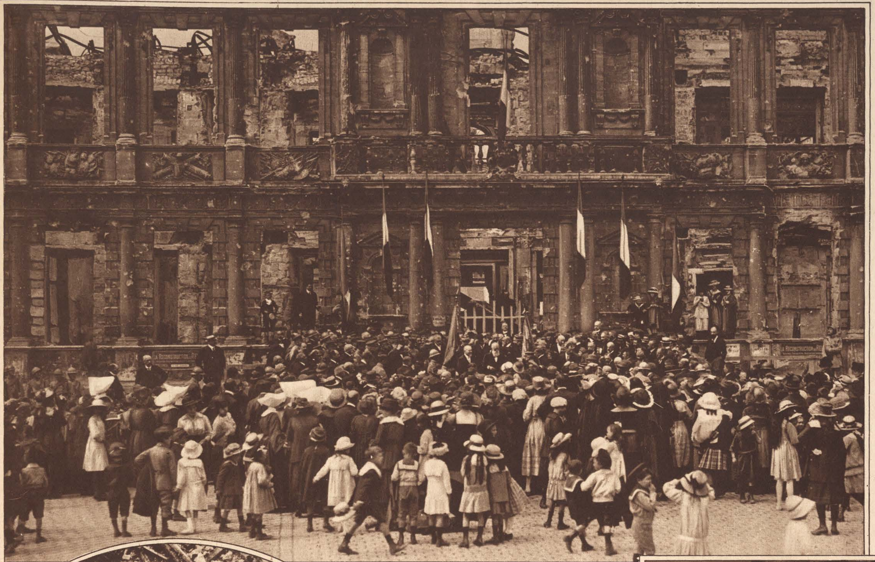
THE CROSS OF THE LEGION OF HONOR FOR RHEIMS: PRESIDENT POINCARE of the French Republic and the Venerable Mayor of Rheims Conducting the Formal Ceremonies of the Decoration of the City for Its Gallant Conduct During the War in Front of the Once Beautiful Hotel de Ville, Now in Ruins, Practically the Entire Population Now Remaining in the City Attending. (Mirzoeff.)