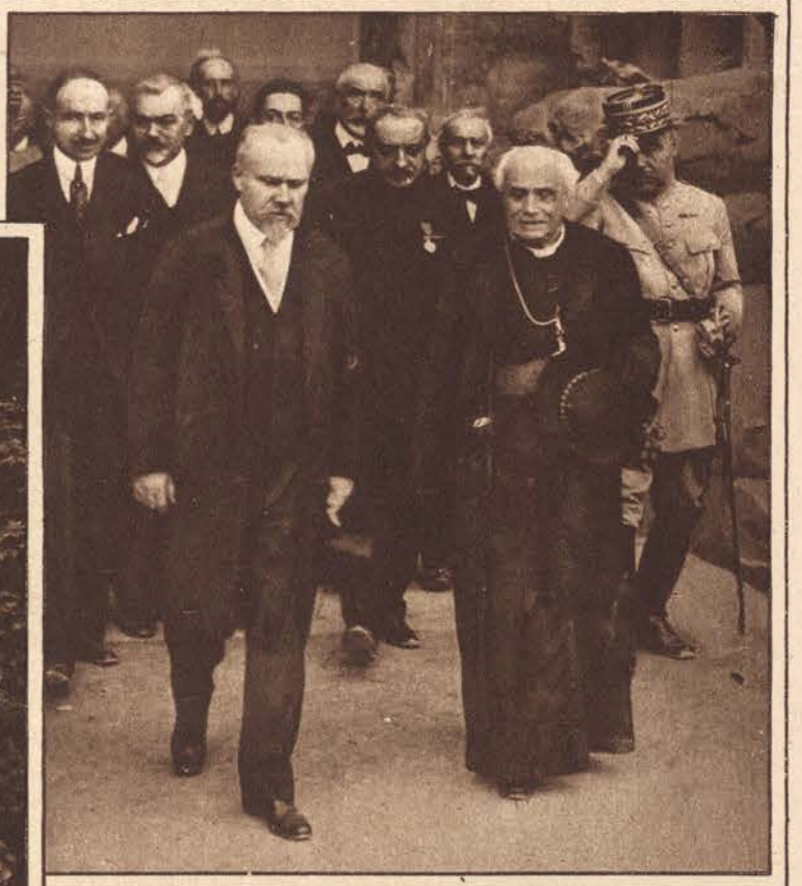
PRESIDENT POINCARE AND CARDINAL LUCON Leaving the Rheims Cathedral After Their Inspection of Its Ruins, President Poincaré Evidently Deeply Disturbed by What He Saw.