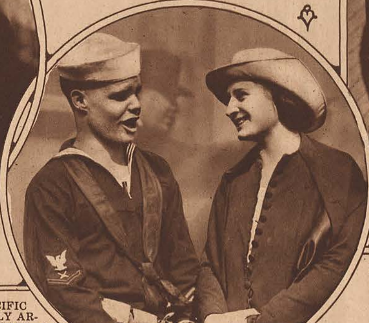
A "GOB" OF THE PACIFIC FLEET DIPLOMATICALLY ARRANGING TO SEE AGAIN A