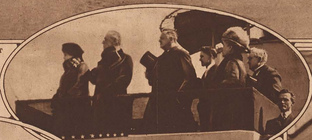
PRESIDENT WILSON, SECRETARY OF THE NAVY DANIELS, and Others of the Reviewing Party Stand with Bared Heads While the Superdreadnought New Mexico, Flagship of the Pacific Fleet, Steamed Past with the Band Playing "The Star-Spangled Banner."