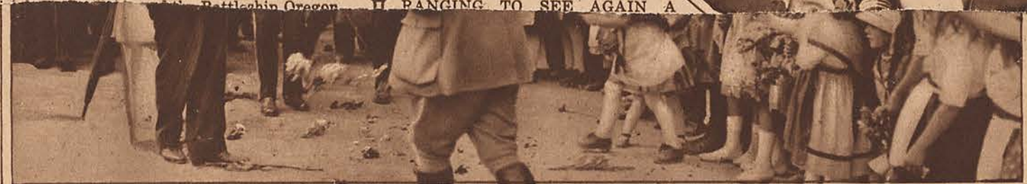
PRESIDENT POINCARÉ, ON HIS RECENT VISIT OF STATE TO THE "LOST PROVINCES," NOW REDEEMED, a Veritable Target for Flowers Thrown by the Little Children of Thionville, Lorraine, Now No Longer the German Dienenhofen.