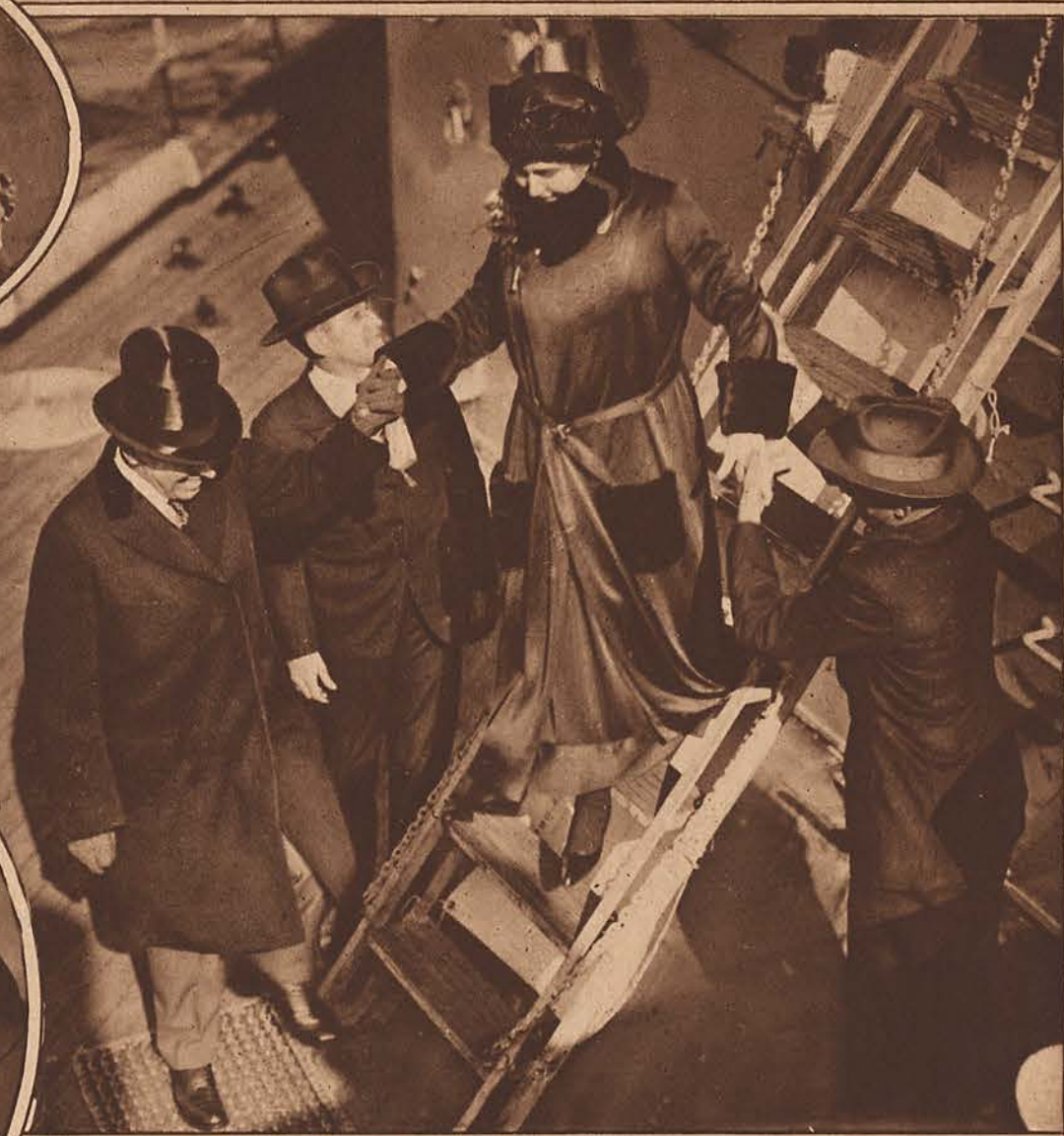
MRS. WILSON CAUTIOUSLY DESCENDING A DECK STAIRWAY ON THE BATTLESHIP OREGON, THE PRESIDENT ASSISTING.