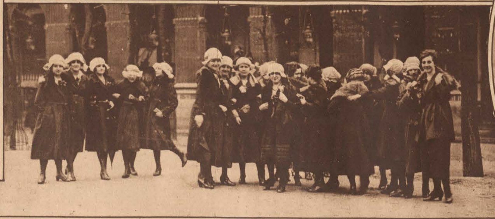
OLD MAIDS' DAY IN PARIS: MIDINETTES, as the Girl Milliners of Paris Are Called, Having Reached the Age of Twenty-five With No Husbands in Sight, and Chances of Marriage Extremely Slender Due to the Havoc of War, Celebrating in Honor of St. Catherine, Patron Saint of "Old Maids" Everywhere.