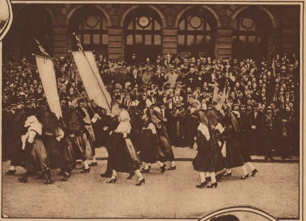
ALSATIAN GIRLS IN NATIONAL COSTUME MARCHING PAST THE OFFICIAL REVIEWING STAND AT THE FIRST OPENING OF STRASSBURG UNIVERSITY Since the Restoration of the "Lost Province," President Poincare, Marshal Joffre, and Other High French Officials, Who Appear on the Stand, Participating in the Ceremonies.