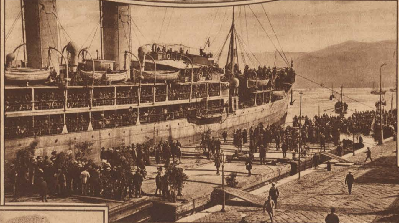
UNITS OF THE GREEK ARMY DEBARKING AT SMYRNA TO OCCUPY THE CITY. (Gherali, from Times Wide World Photos.)

(Gherali, from Times Wide World Photos.)