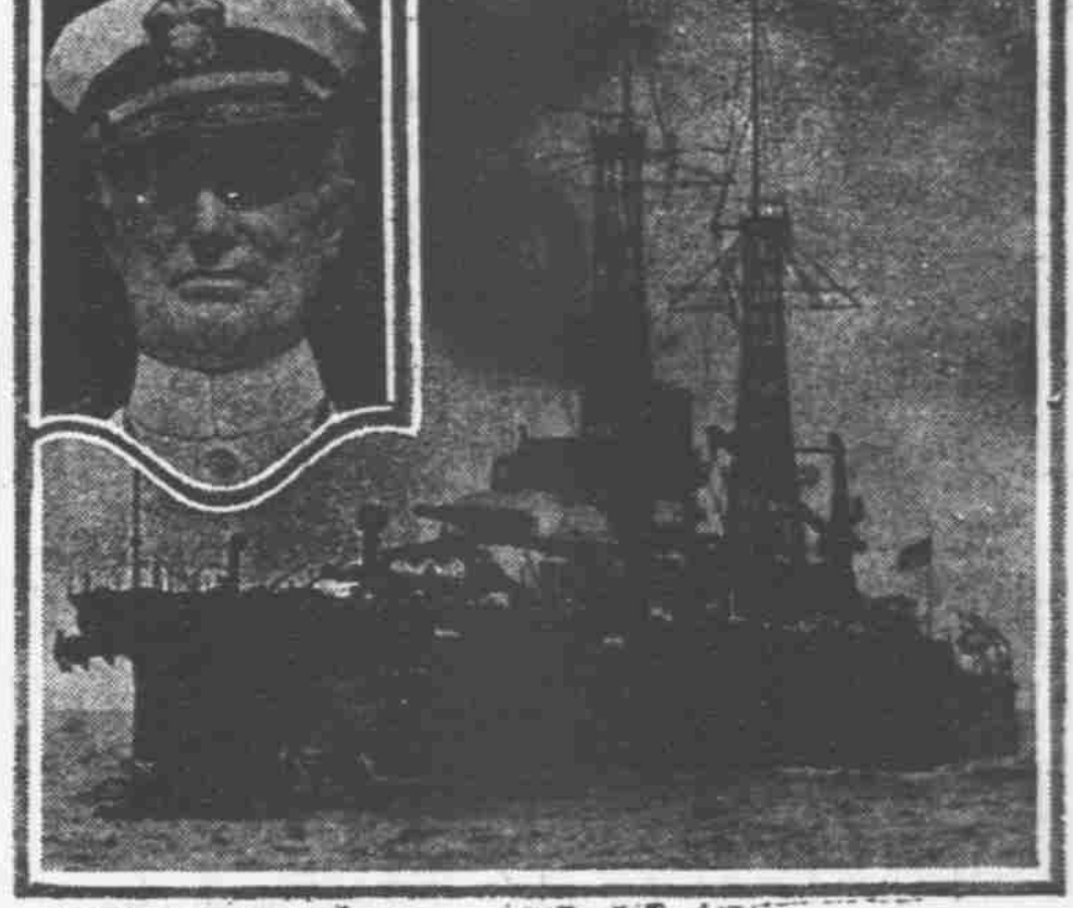
ADMIRAL HENRY B. WILSON AND U. S. S. PENNSYLVANIA. Admiral Wilson succeeds Admiral Henry T. Mayo, who becomes head of the navy selection board.