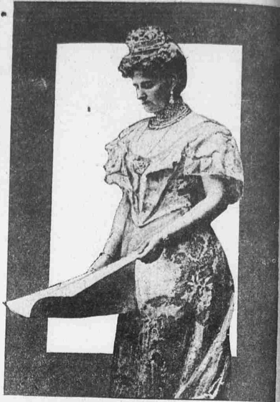
MOTHER OF DUAL MONARCHY'S NEW RULER The Archduchess Maria Josepha, whose son is Emperor of Austria and King of Hungary, was a Saxon princess, but is said to entertain a great dislike for the German Kaiser. She has the reputation of being the most ambitious royal woman in Europe. Her son's elevation fulfills her lifelong dream.