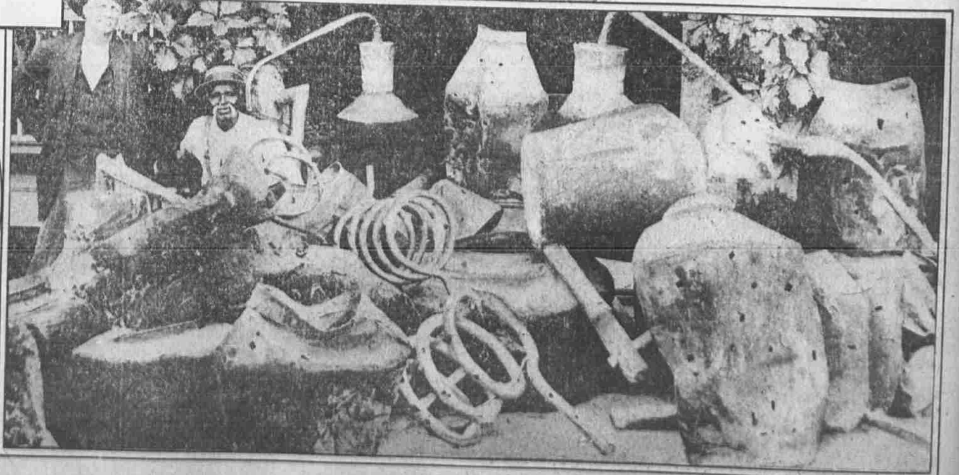
SAID ON "MOONSHINE" DISTILLERIES IN THE SOUTH The mass of crumpled metal is composed of the remains of captured boilers and pipes after they had been hacked to pieces by the revenue officers of Richmond County, N. C. Most of these implements are crudely made of copper and lead.