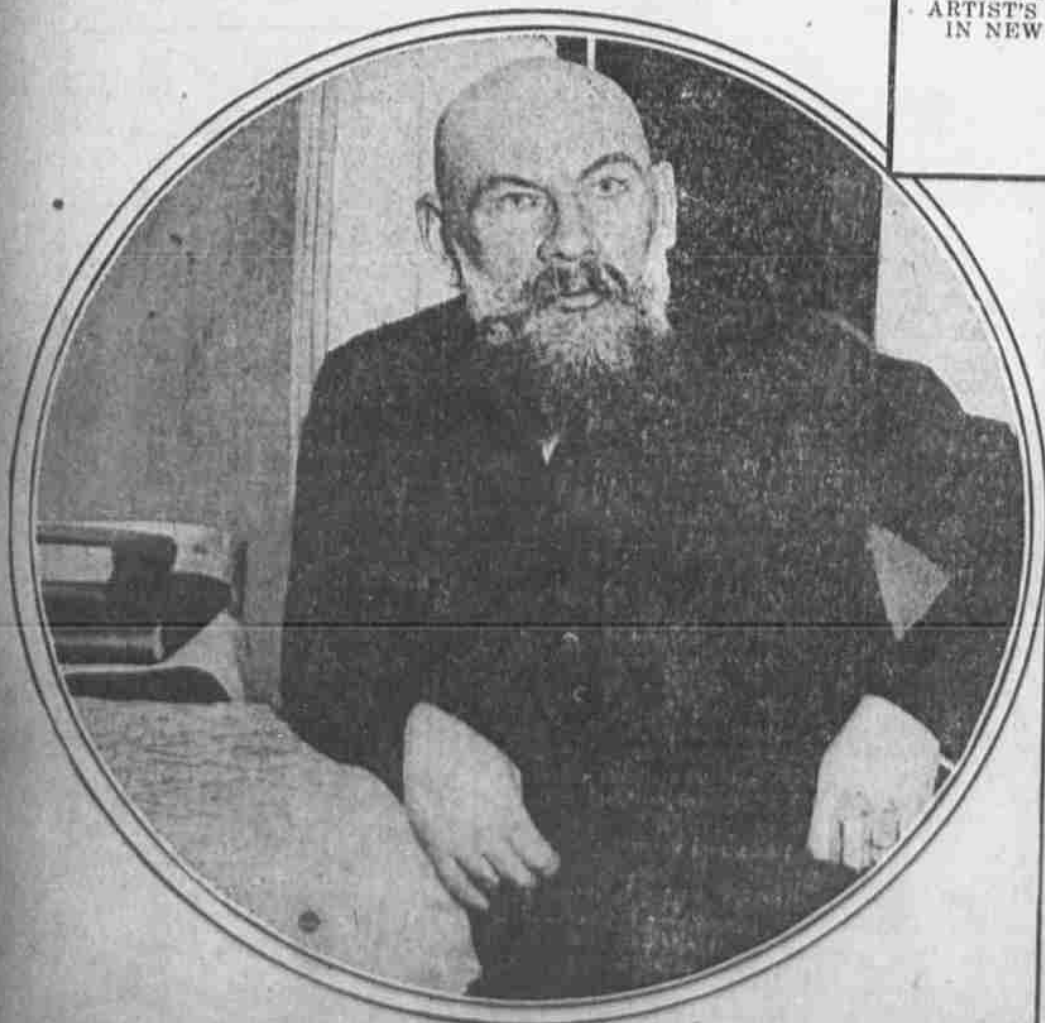
COUNT ELI TOLSTOY The second son of the great Russian has arrived in this country for a lecture tour. His features are strikingly like those of his famous sire.