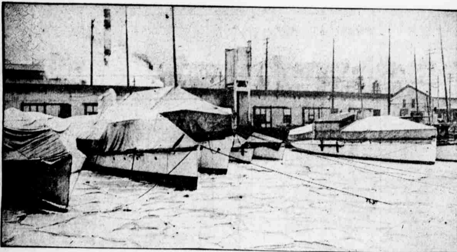
FLEET OF SPEEDY SUBMARINE CHASERS WHICH READILY CAN BE PRESSED INTO SERVICE BY THE UNITED STATES These fast little boats have been turned out for the Allies by Seabury's Boat Works, of New York, and now are awaiting delivery. Thousands of other motor craft could be commandeered in event of war.