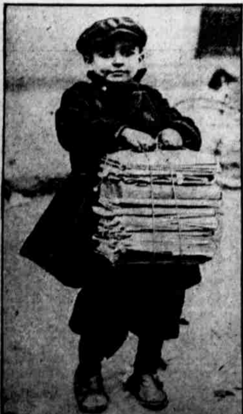
PAPER SHORTAGE A GOD-SEND TO THE SMALL BOY