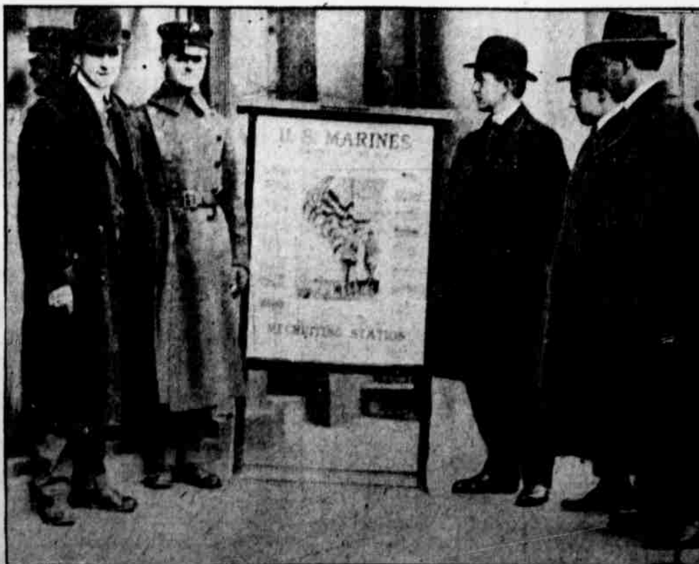
RECRUITING OF MEN TO FILL UP THE GAPS IN THE UNITED STATES NAVY MADE EASIER BY WAR TALK