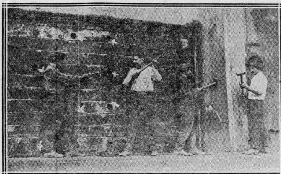
IN ACCORDANCE WITH DISARMAMENT TREATY workmen in Philadelphia are shown (above), tearing armor plate off U. S. S. Maine.