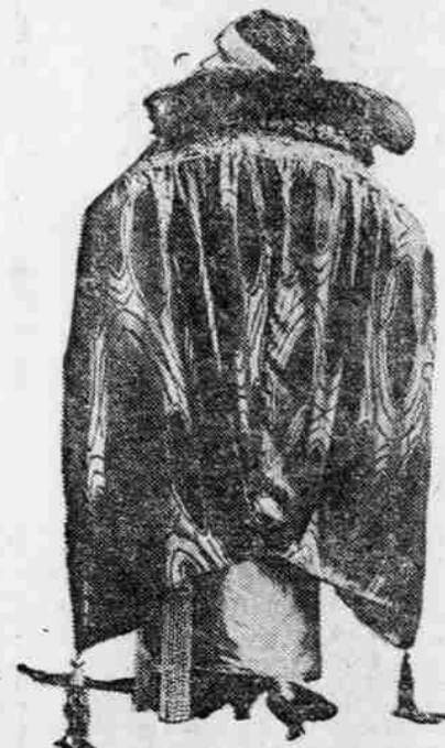
MARIE, QUEEN OF ROMANIA, "mother-in-law of Balkans," wore this magnificent cape at wedding of her daughter to King of Serbia.