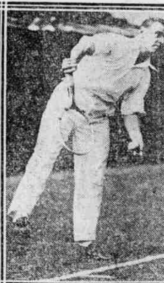
GERALD PATERSON is Australia's mainstay in challenging American holders for Davis cup, emblematic of world's tennis championship.