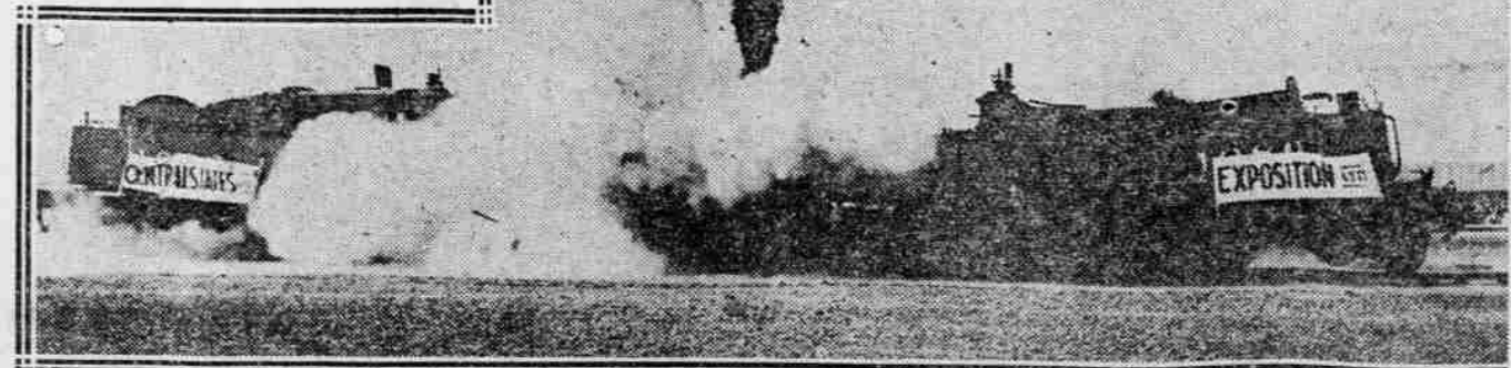
WHAT HAPPENS WHEN TWO LOCOMOTIVES CRASH HEAD-ON—As attraction at Central States Fair, Aurora, Ill., two engines were sent together at full speed (right). There was a tremendous roar and clouds of steam, but both engines remained on track.