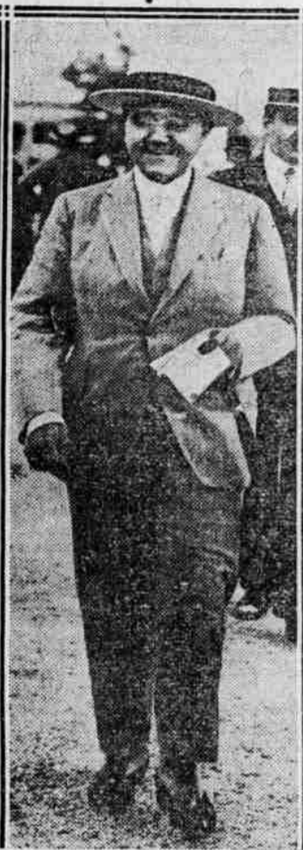
NEW AND INTIMATE PORTRAIT of young Shah of Persia taken at races at Deauville, France, where some of his parties have attracted international attention.