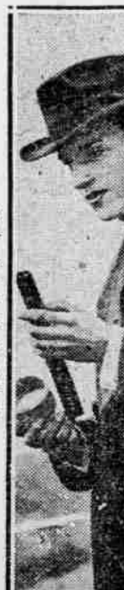
CHARLES M. HATFIELD, "RAIN-MAKER," (right) is now in Naples, Italy, trying to end drought.