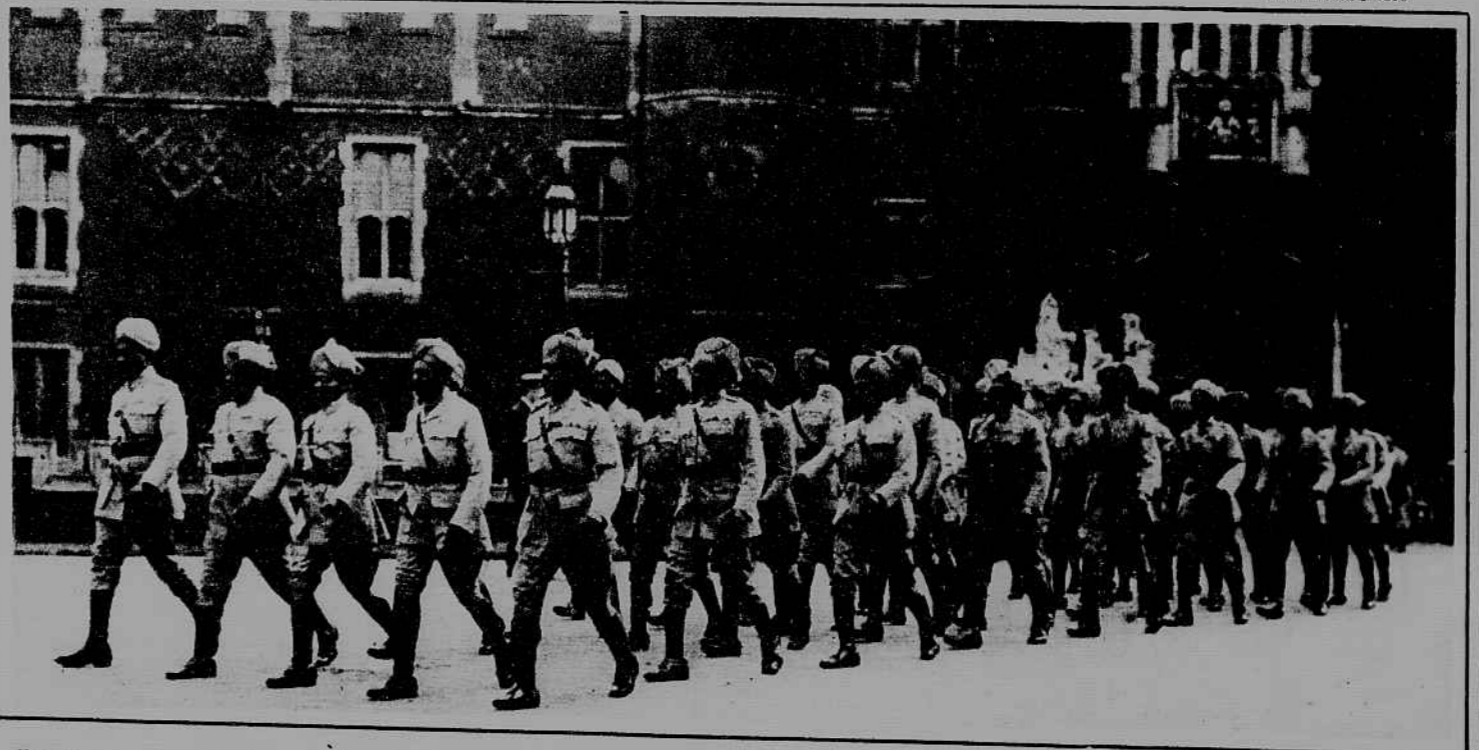
British troops from India arrived too late to participate in London's great Victory parade, so they had a special review of their own. A regiment of these dusky turbaned fighters is shown on their way to Buckingham Palace, where they were inspected by their Emperor, King George.