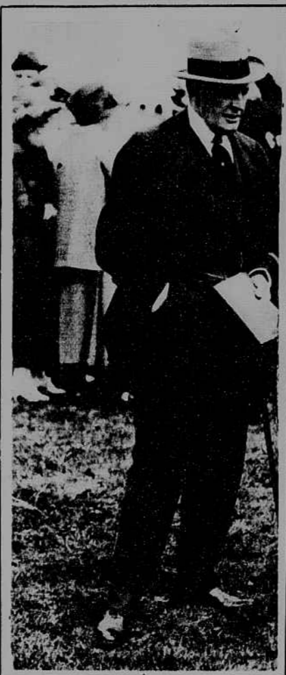
Of course you don't recognize him in civies, or, as they say abroad, in multi. Vice-Admiral Sir David Beatty, commander in chief of the British Grand Fleet during the Great War—an interested spectator at a recent British agricultural fair.