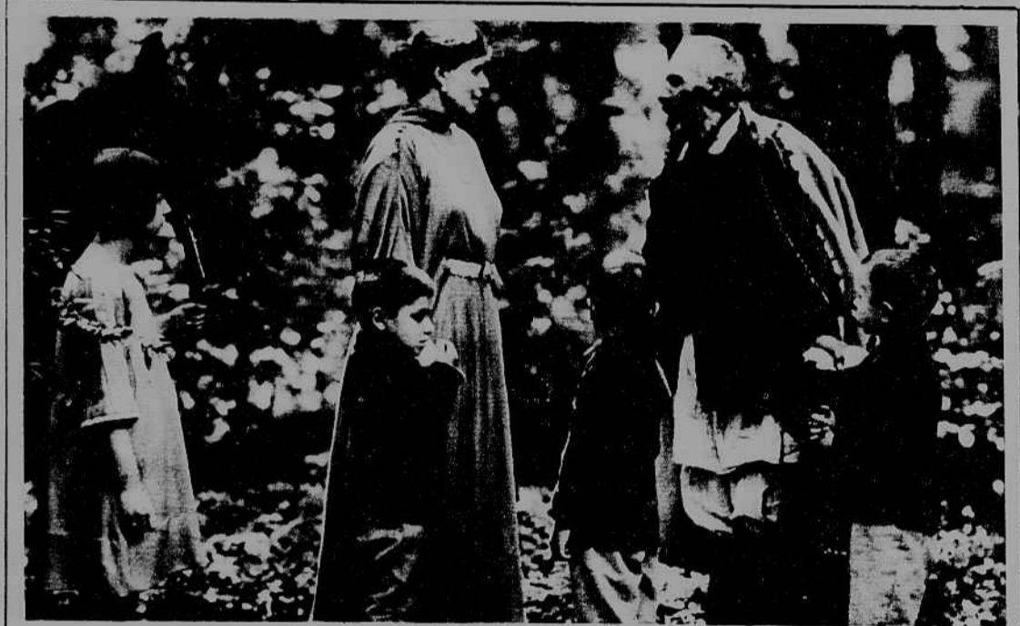
Beloved Queen Marie of Rumania mingles with her country people and helps in the distribution of American Red Cross supplies. Little Princess Illyana is on the left, holding the bridle of her pony. Rumor has it that the Queen will visit America this year.