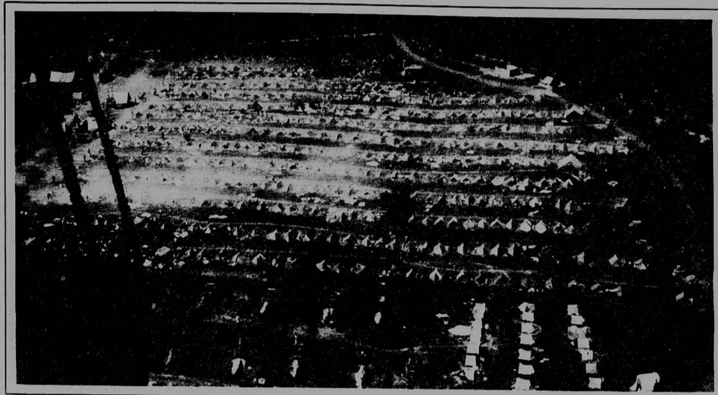
The rows of pup tents that shelter our future generals at the splendid summer camp of the West Point Cadets at Monroe, N. Y., photographed from an airplane at an altitude of about 2,000 feet. L. F. S.