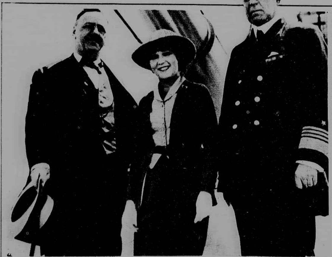
Three bosses of the navy, Secretary Daniels, Mary Pickford and Admiral Hugh Rodman, commander of the new Pacific Fleet, from a photograph taken on the U. S. S. Texas in Los Angeles harbor, just after the ceremony at which Miss Pickford was made "little sister of the navy," the title won by the film star as sponsor of the Texas, which won the "Match the Navy" Victory Loan contest.