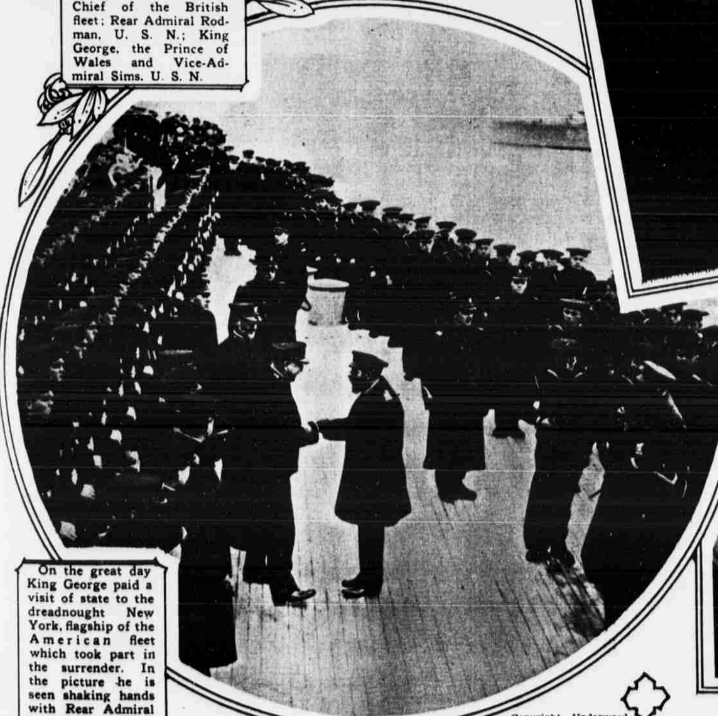
On the great day King George paid a visit of state to the dreadnought New York , flagship of the American fleet which took part in the surrender. In the picture he is seen shaking hands with Rear Admiral Rodman.