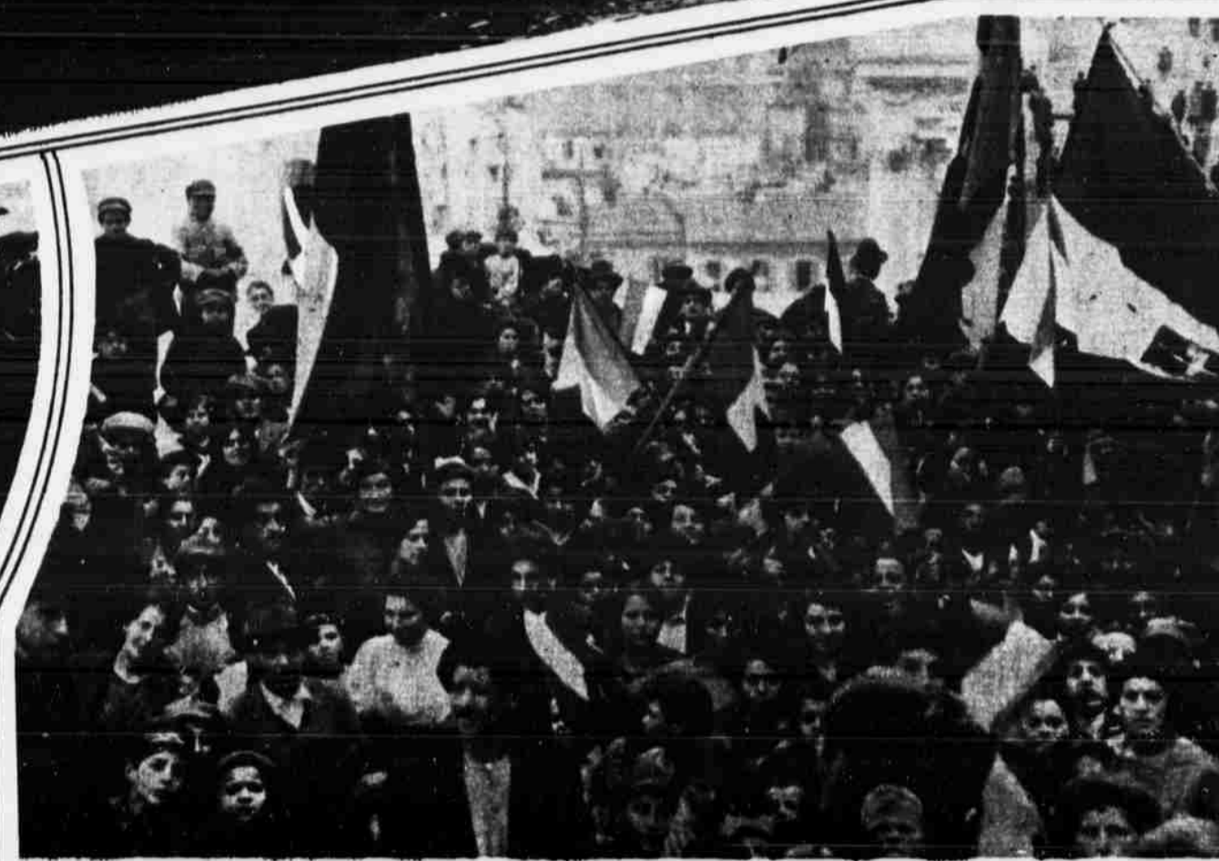
Rome celebrates the victory. A section of the vast crowd that for several days and nights took part in the greatest expression of joyful triumph the ancient city by the Tiber has ever known.