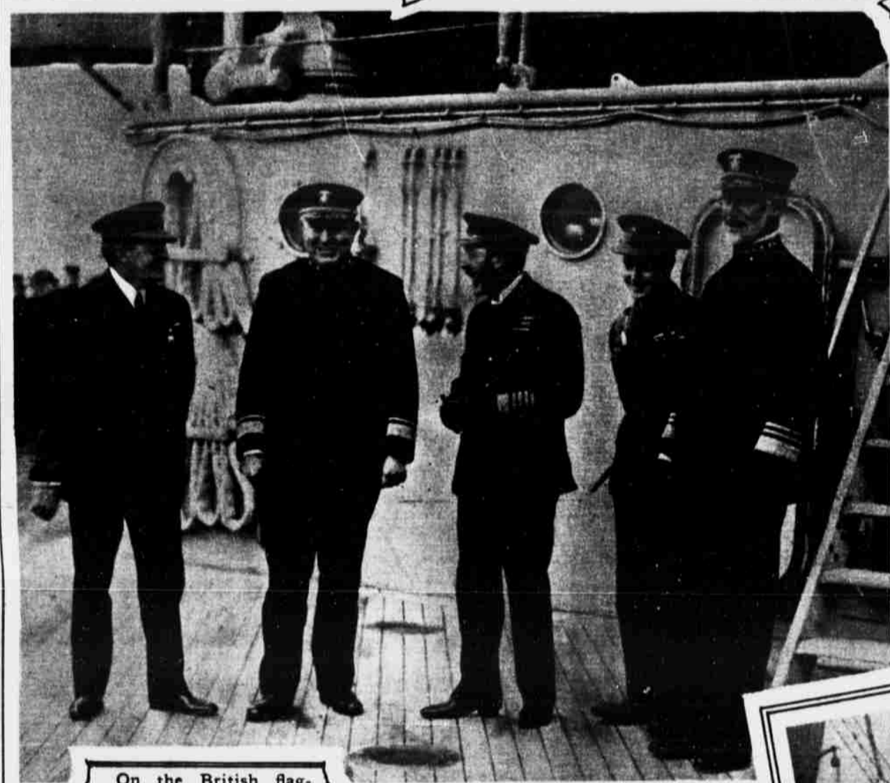
On the British flagship Surrender Day . Left to right, Sir David Beatty, Commander in Chief of the British fleet; Rear Admiral Rodman, U. S. N.; King George, the Prince of Wales and Vice-Admiral Sims, U. S. N.