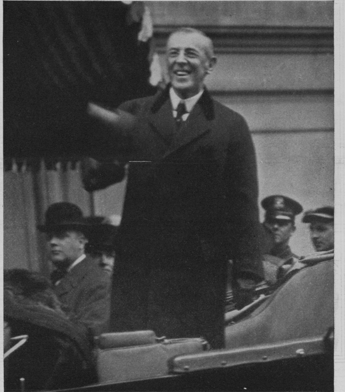
THE PRESIDENT STANDING UP IN HIS AUTOMOBILE IN RESPONSE TO THE PROLONGED CHEERING