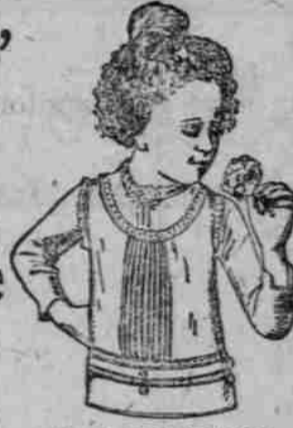
"H. & W." WAIST.

It is a well known fact that the "H. & W." line is the most extensive and conforms more closely to hygiene than any other make. We carry a full line of "H. & W." Waists for women, misses and children. "H. & W." Dress Form and Corset Combined, "H. & W." Brassiere Bust Reducing Corset Covers. We illustrate style No. 1969 of "H. & W." Brassiere Bust Reducing Corset Covers. Made of excellent quality batiste; closed back and three pearl buttons in front. The string regulates the fit at the waistline. The character and points considered in bringing out this garment are the lower gored section and the formation of the bust by vertical seams carefully arranged to produce a more delicate fit of the garment. Sizes 32 to 46—odd and even.