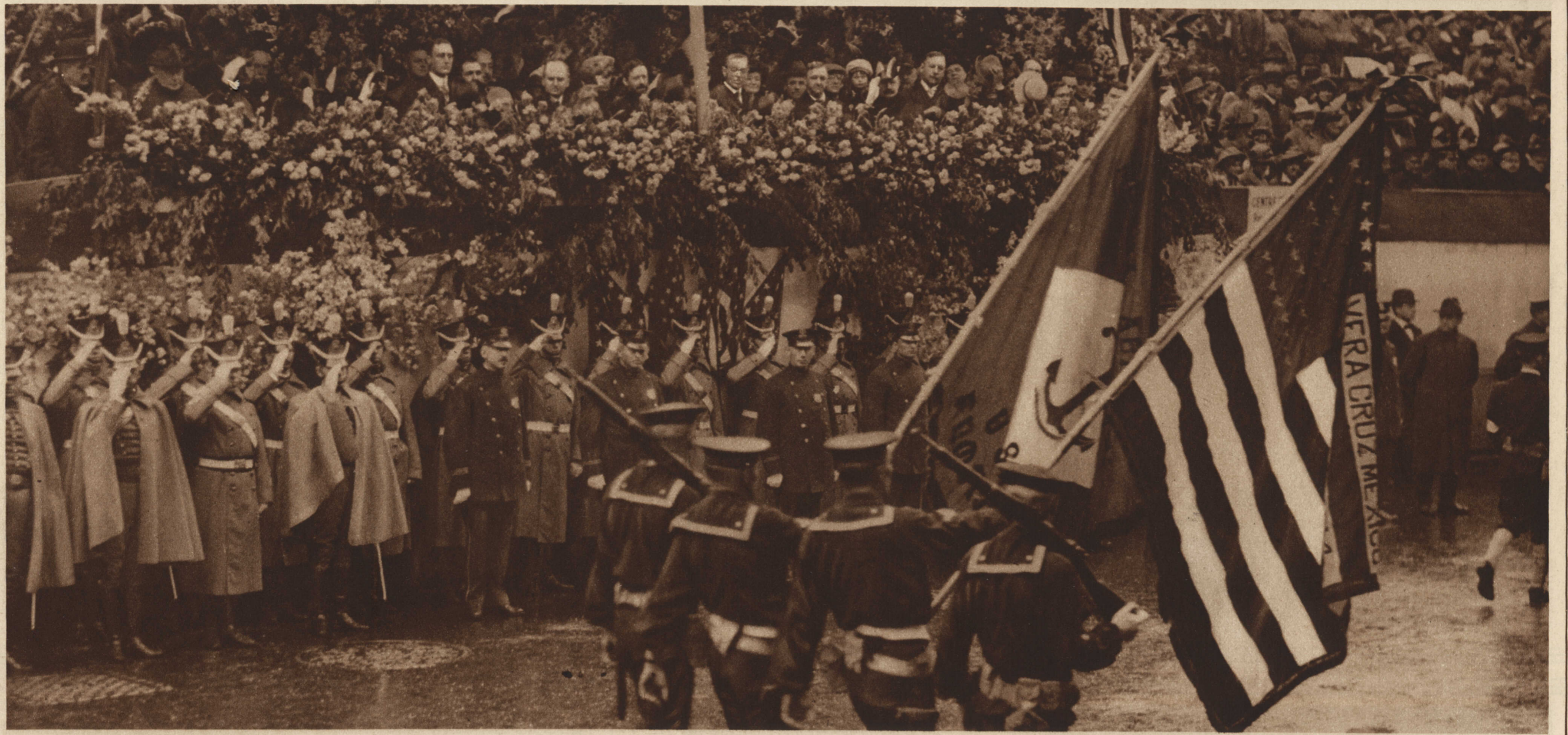
PRESIDENT WILSON AND OFFICIALS ON THE REVIEWING STAND IN FRONT OF THE NEW YORK PUBLIC LIBRARY SALUTING THE FLAG FROM THE U. S. S. FLORIDA, WHICH FLEW AT VERA CRUZ In the Group, Left to Right, are Assistant Secretary Franklin D. Roosevelt, Secretary Tumulty, Acting Mayor George McAneny, President Wilson, Secretary Daniels, and Admiral Fletcher