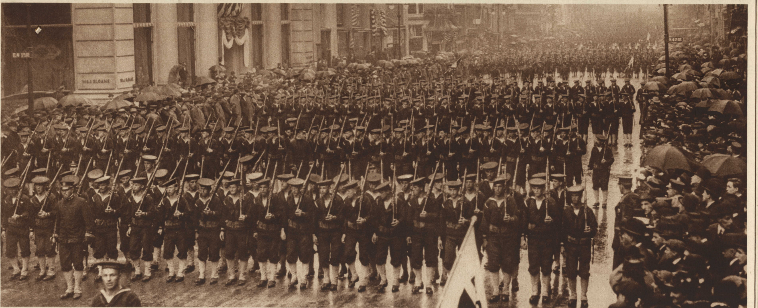
SAILORS AND MARINES OF THE ATLANTIC FLEET PASSING UP FIFTH AVENUE AFTER THE REVIEW BY THE PRESIDENT