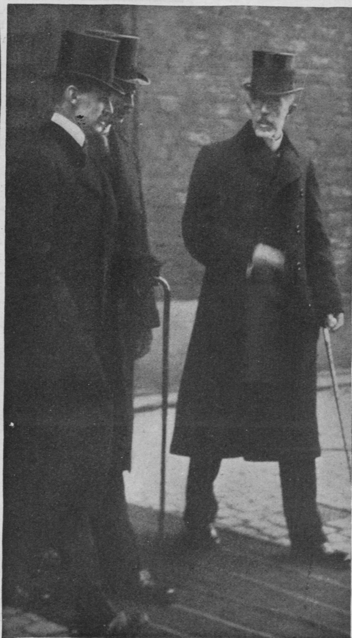
Their Majesties, King Haakon VII. of Norway, King Christian X. of Denmark, and King Gustaf V. of Sweden, Leaving St. Petri Church, Malmoe, on the Occasion of Their Recent Conference