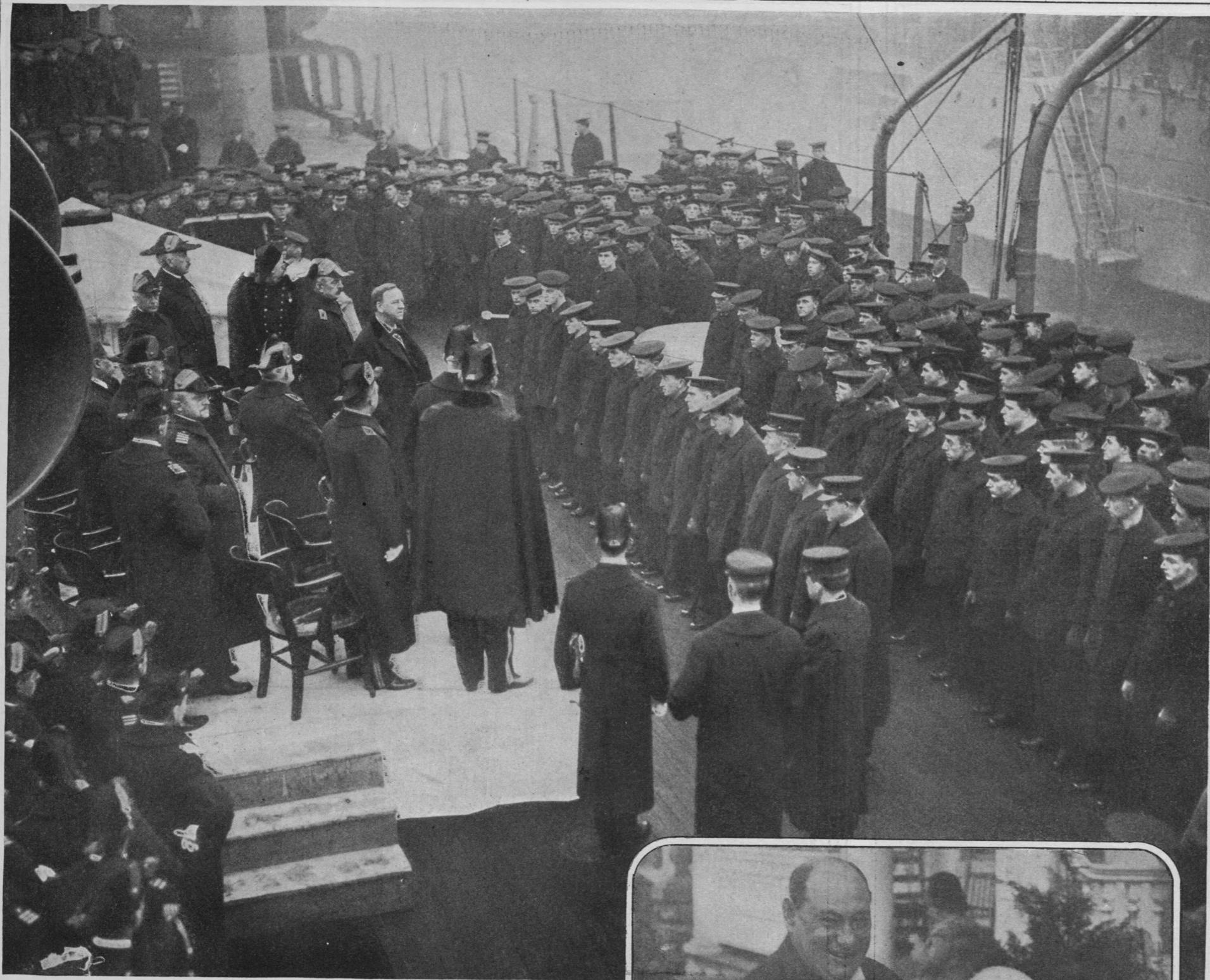
SECRETARY DANIELS OF THE NAVY, ON THE BATTLESHIP FLORIDA, ADDRESSING THE MEN WHO WERE AWARDED MEDALS OF HONOR FOR "EXTRAORDINARY HEROISM" DISPLAYED IN THE CAPTURE OF VERA CRUZ