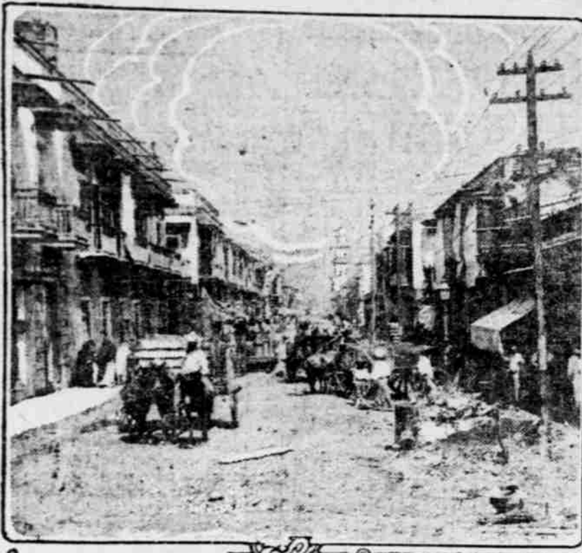
Calla Independence, the principal street in Vera Cruz, Mexico.

Here is the principal street in Vera Cruz, Mexico's largest seaport. Uncle Sam's warships in Vera Cruz harbor are filled with hundreds of marines, who will occupy the city in case of intervention.