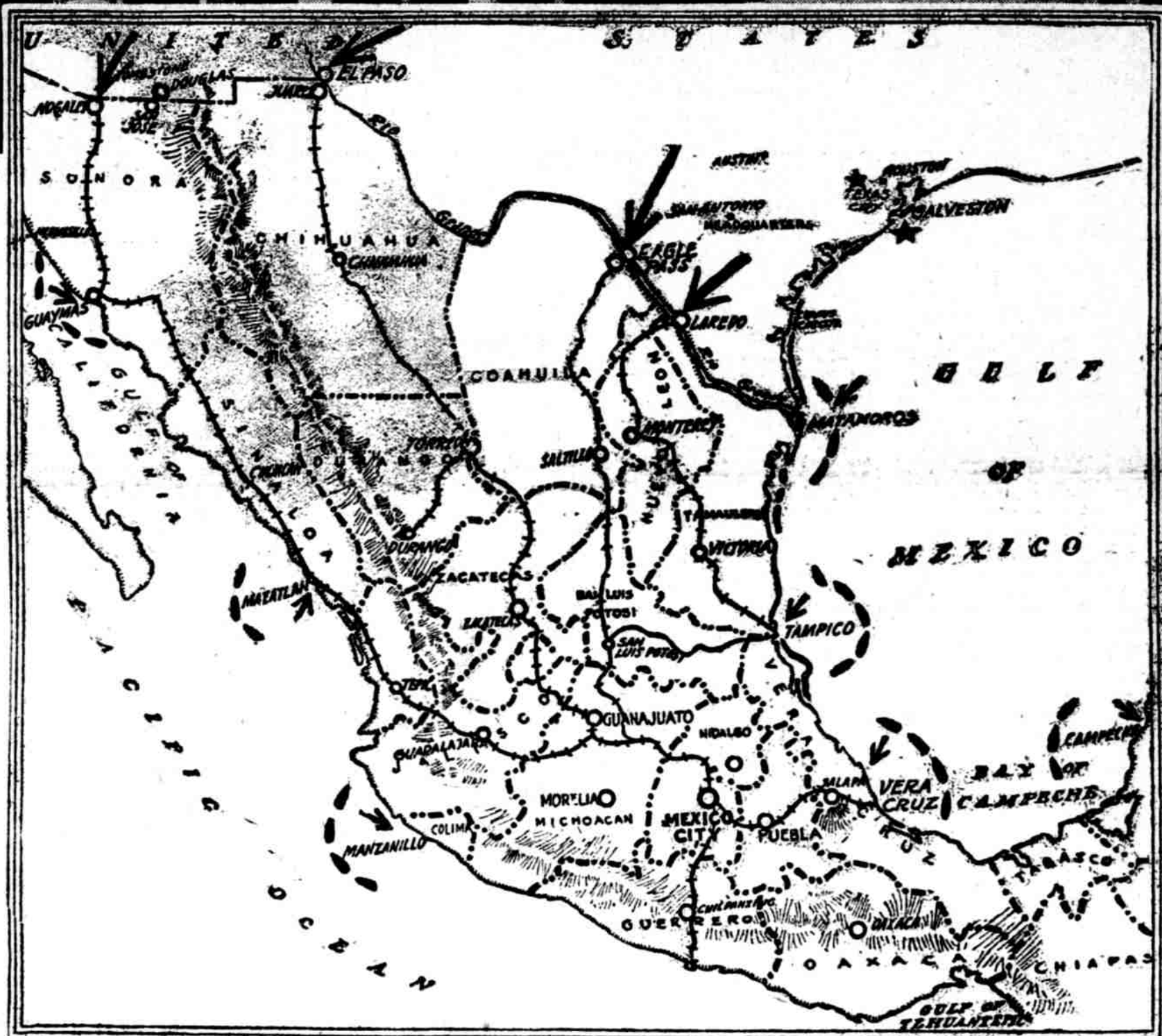
MEXICO, AND THE STRATEGIC POINTS. The larger arrows indicate where the United States troops are mobilized, and also where any forward movement would be made. The Mexican forts which would be blockaded in case intervention comes are indicated by smaller arrows. The star indicates the camp of the 10,000 infantrymen under General Carter, who would be sent to Vera Cruz on transports should the army move. Stars show the points at which American troops have been mobilized.

Twenty-five Greeks, veterans of the Balkan war, yesterday made application to enlist as volunteers in the service of the United States should war be declared against Mexico.