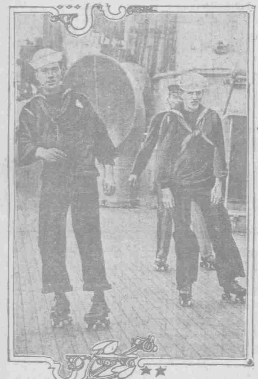
United States sailors at play. The photograph shows sailors of the North Dakota, one of the battleships, at anchor in the Hudson river, New York, roller skating on deck of the fighting vessel. The North Dakota is one of the battleships of the immense gathering of war vessels now mobilized in the Hudson river.