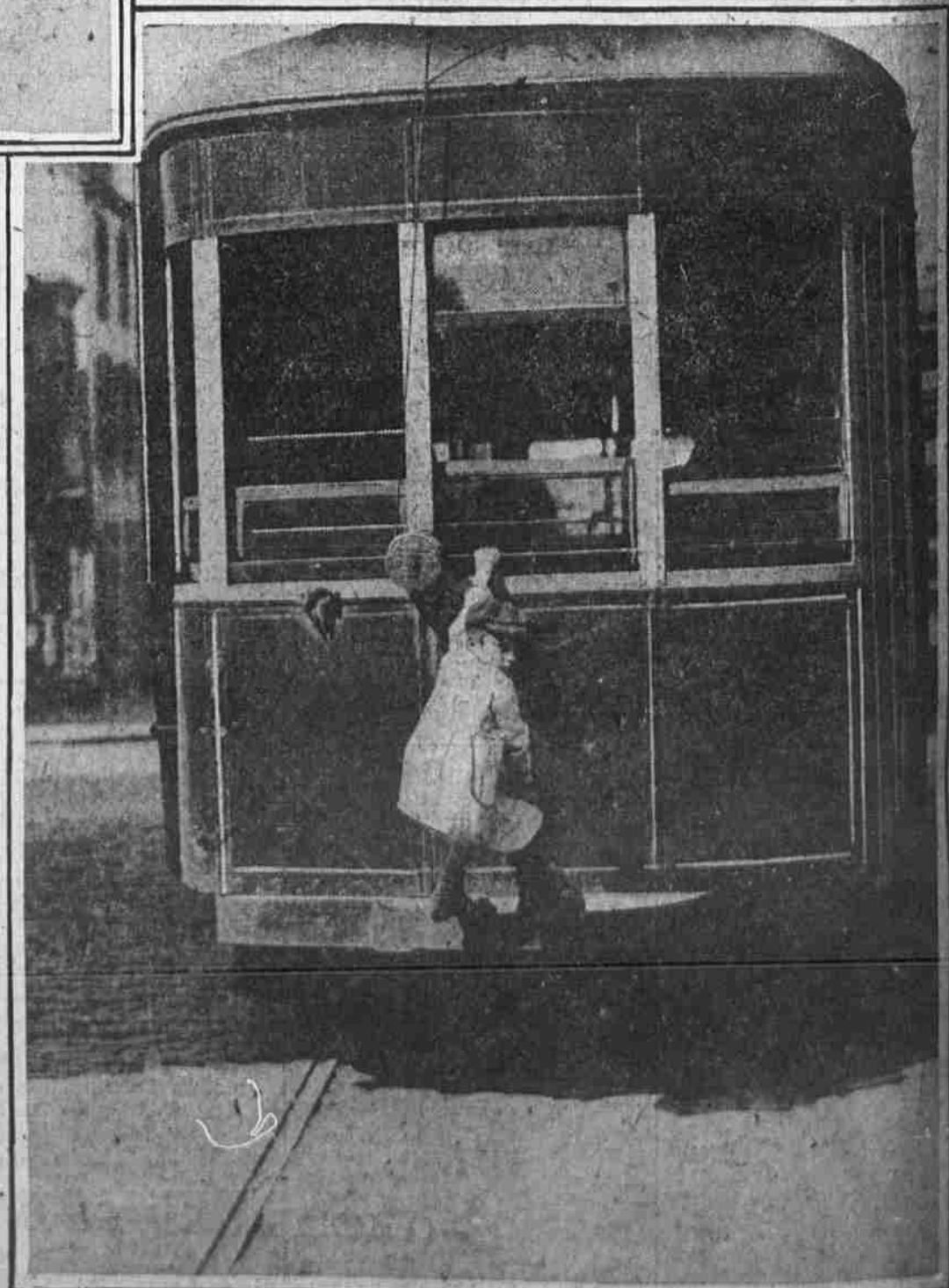
ONE OF THE LEADING CAUSES OF INFANT MORTALITY This youngster leaped upon the narrow rear ledge of a street car while it was in motion and only a few feet in front of the Ledger Photo Patrol car, from which this picture was taken.