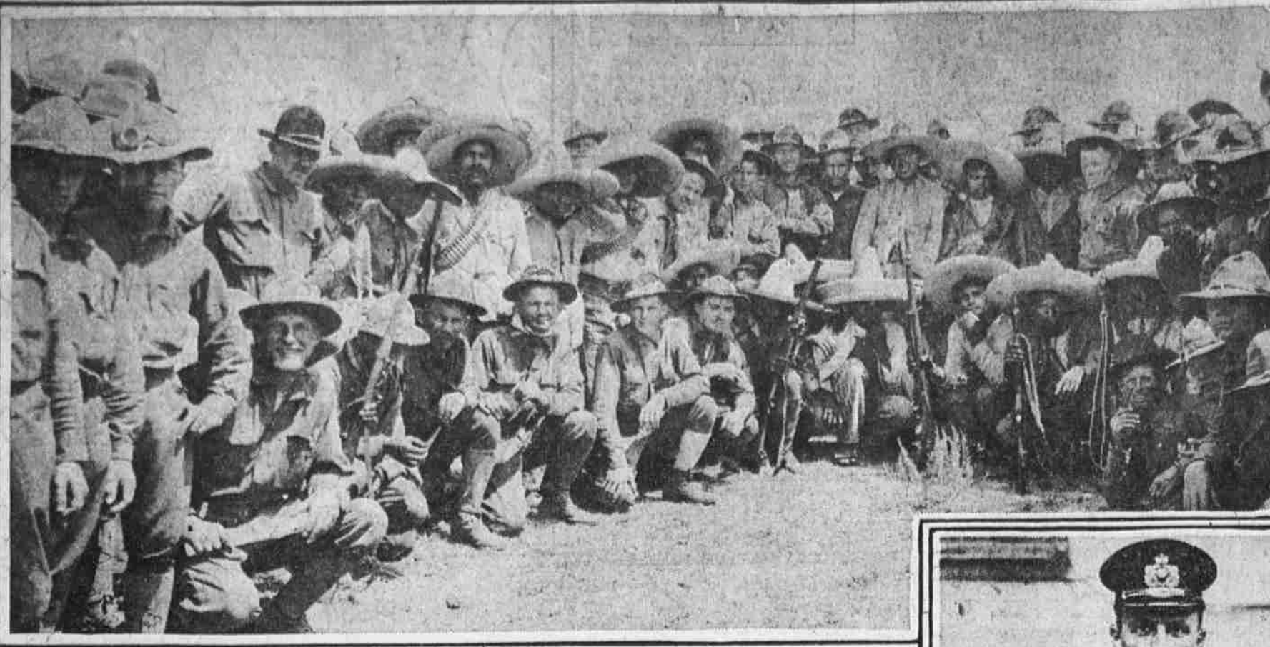
CARRANZISTAS AND AMERICAN TROOPS INTERMINGLE AS IF OLD FRIENDS There is no evidence of the hostility against soldiers of the United States, alleged to be rife among the First Chief's men, in this picture, taken at the San Antonio (Mex.), base of the American expeditionary force. This group is of special interest in view of the new "crisis."

GRAPHIC NOTES AND COMMENT ON THE VARIED NEWS OF THE DAY AS RECORDED BY THE CAMERA