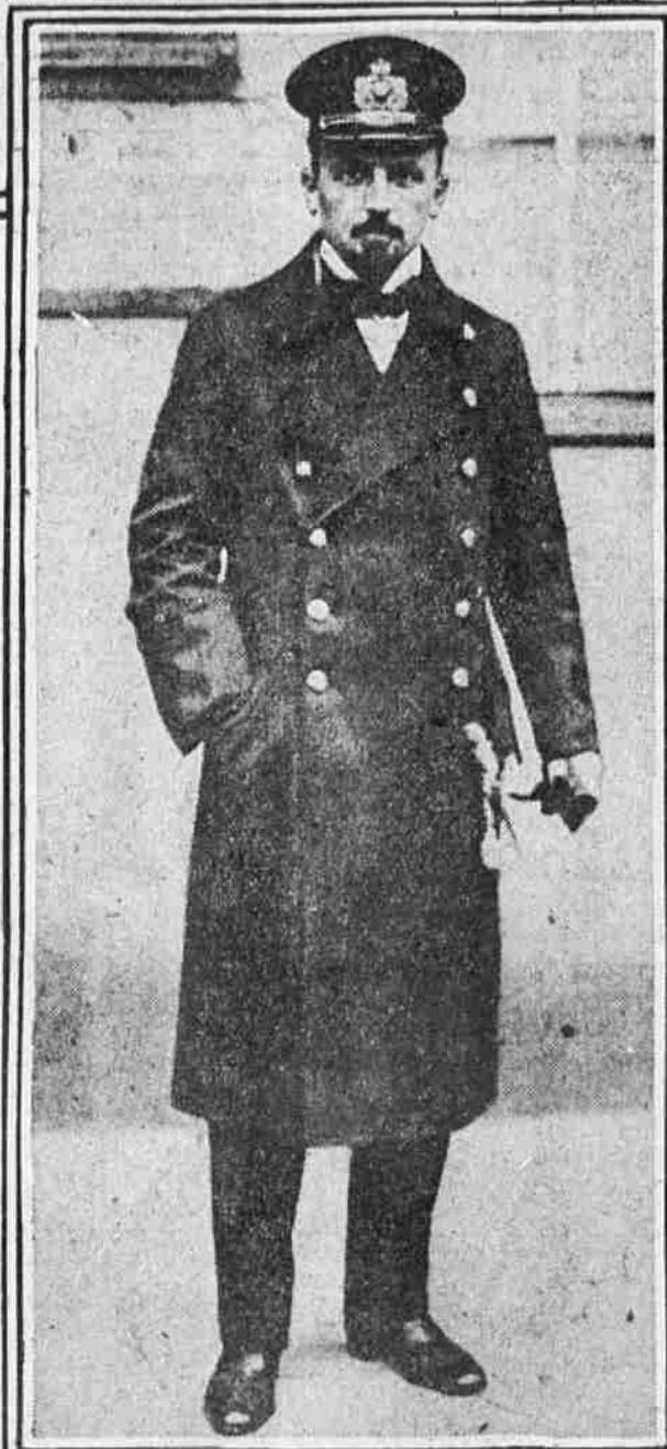
SKIPPER OF FAMOUS GERMAN RAIDER Count Dohna was the commander of the Moewe when she made her daring foray out upon the Atlantic, finally capturing the Appam.