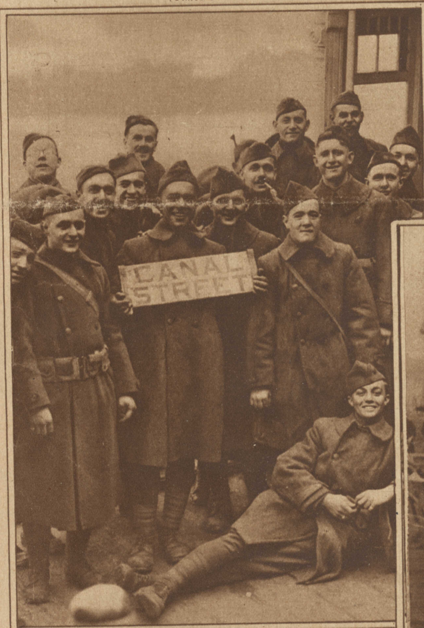
FROM CANAL STREET TO FRANCE AND RETURN.