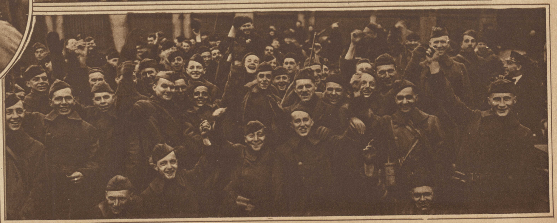
THE UNIVERSAL SMILE OF THE 59TH'S BOYS

May Be Accounted for by the Fact That the Regiment Saw Some of the Fiercest Fighting in the War But Suffered Only Twelve Casualties on the Field of Battle.