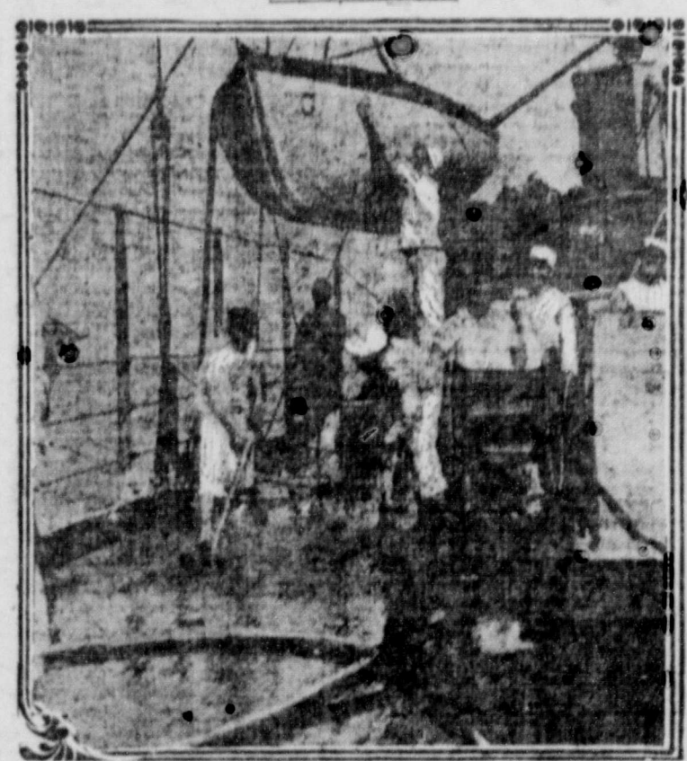
with Admiral Evans' Fleet.