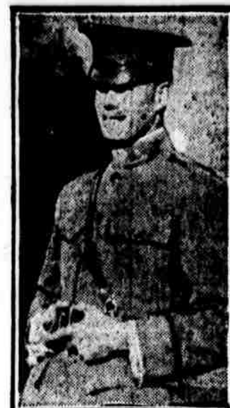
HUSKY ARMY FOOTBALL SQUAD INVADES PHILADELPHIA. Warlike activities are under way at Franklin Field in preparation for the battle with their traditional rivals, the Navy, tomorrow. West Point's brawny football warriors are shown above engaged in secret practice on Penn's gridiron. On the left is pictured Major Charles Daly, head coach and famous football authority, in charge of squad. End Coach Major Neyland is shown on the right.