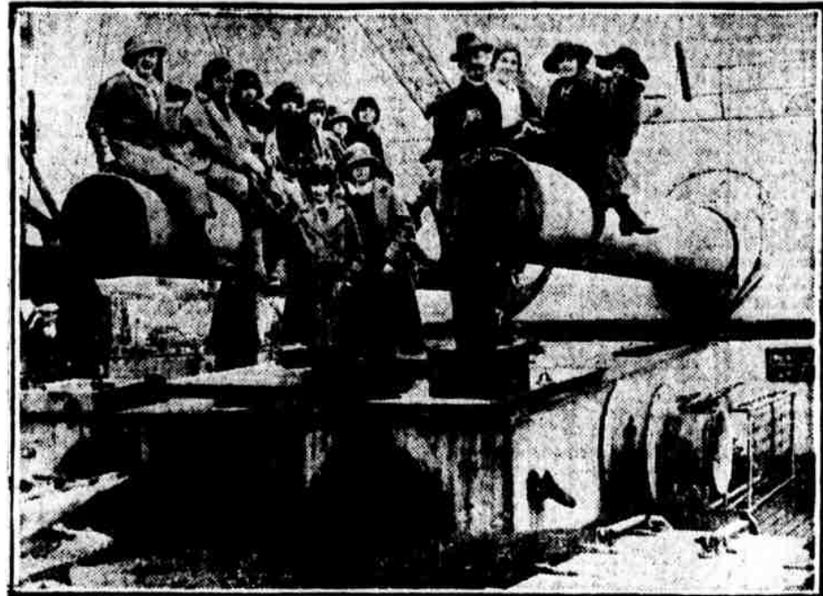
PAYING THEIR LAST TRIBUTE to the U. S. S. Missouri, girls of the Saybrook School, Overbrook, gathered on the deck of the old battleship, now being scrapped at Bridesburg, on the Delaware.