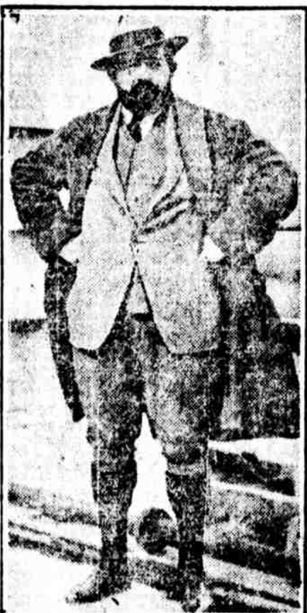
JO DAVIDSON, American sculptor, was among those sailing for Europe recently on the S. S. Paris.