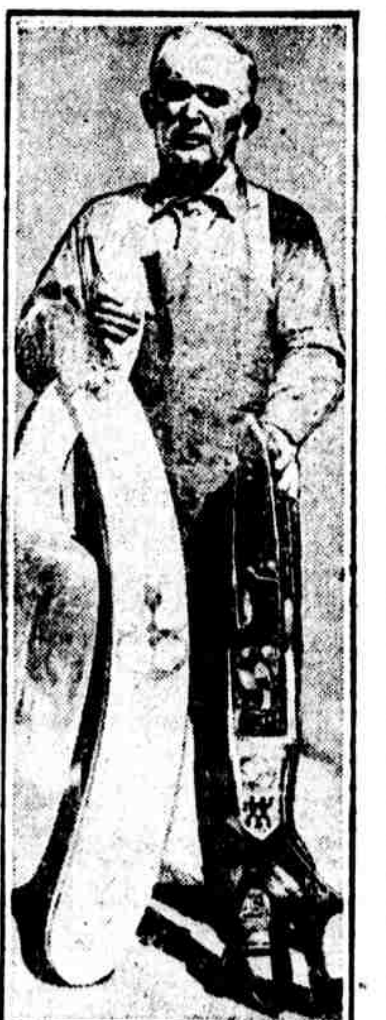
GOLIATH MIGHT HAVE used shears and razor made by California cutler.