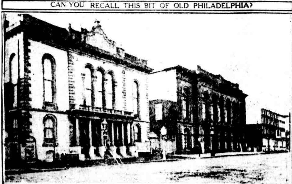
CAN YOU RECALL THIS BIT OF OLD PHILADELPHIA?