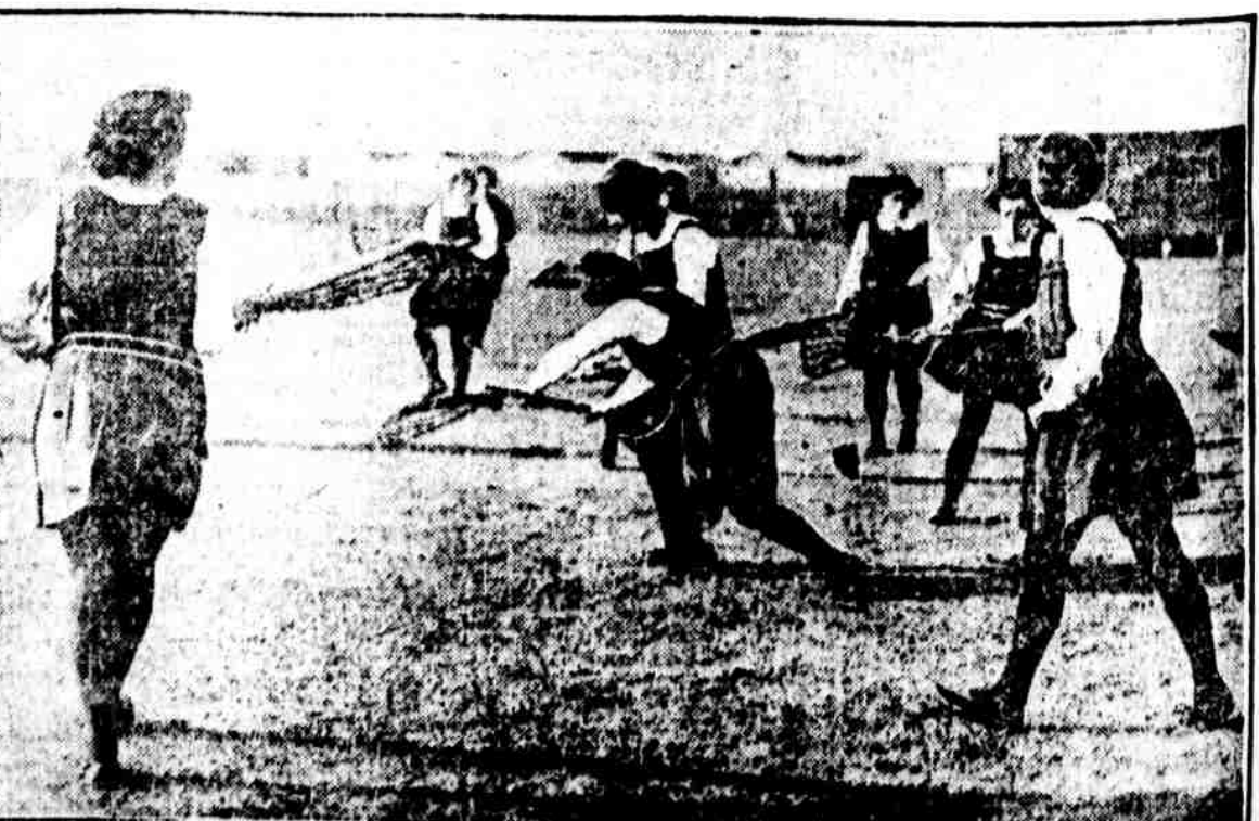
STIRRING ACTION marked the hotly contested lacrosse match at Northolt, when the London School of Medicine crossed sticks with Bedford College. The camera caught the fair British athletes in action during an exciting moment of the game.