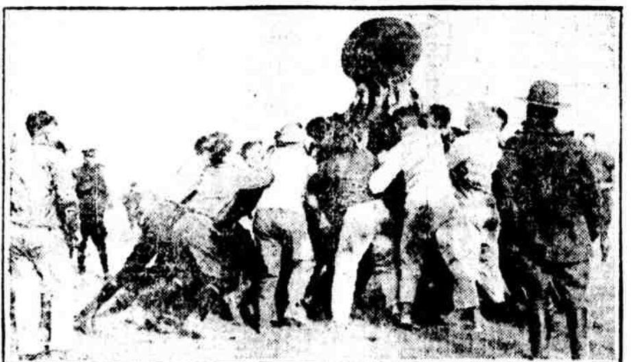
BATTLING FOR VICTORY in the pushball contest recently staged at Camp Humphreys, as part of program to determine the best all-round company; boys of that Virginia encampment are shown above during the fray.