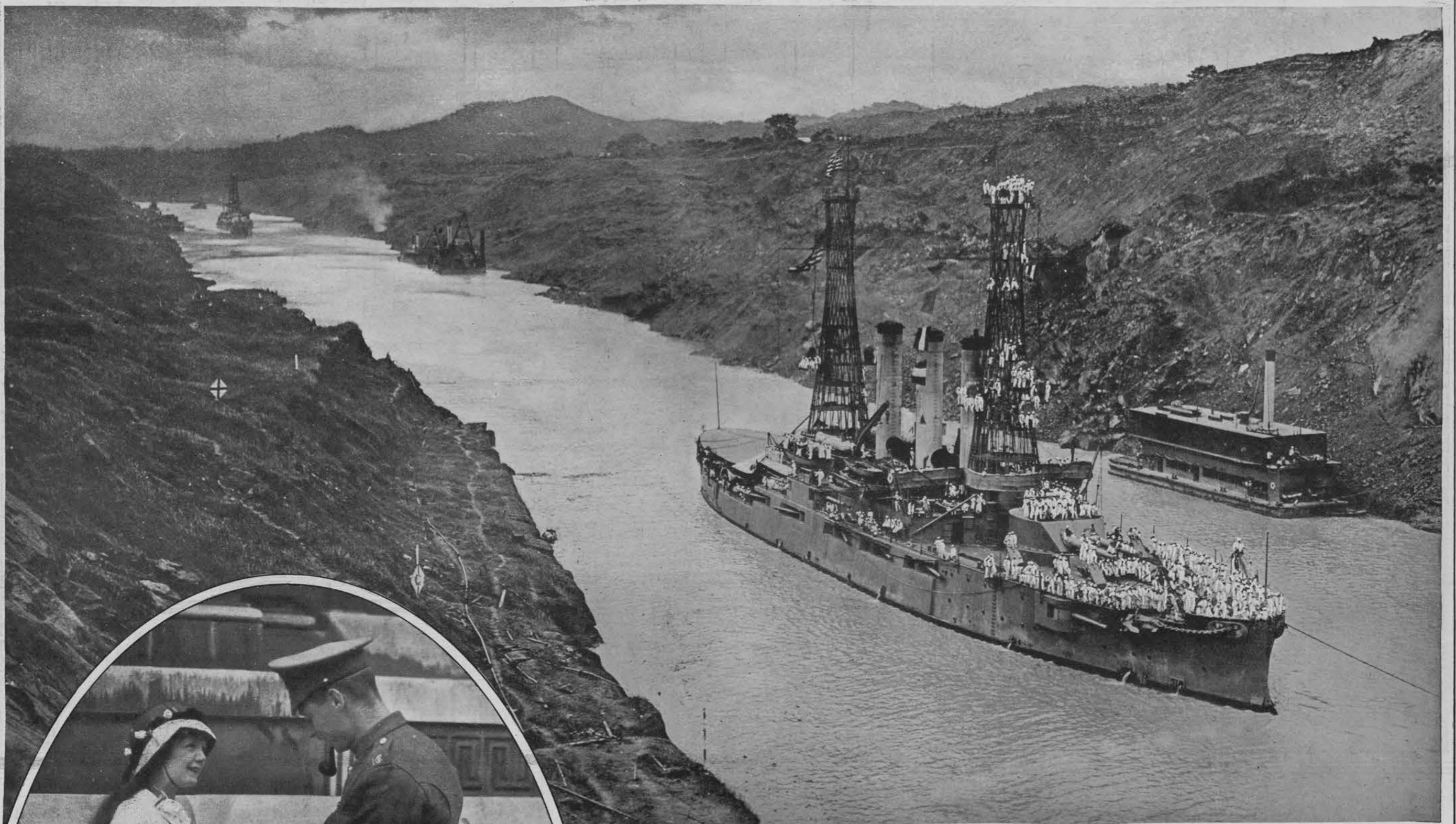
United States Battleship Missouri, Followed by the Battleships Ohio and Wisconsin, Passing Through the Panama Canal Bound for San Francisco, Marking the First Time in History When American Warships Have Passed from the Atlantic to the Pacific Coasts Without First Rounding the Continent of South America.