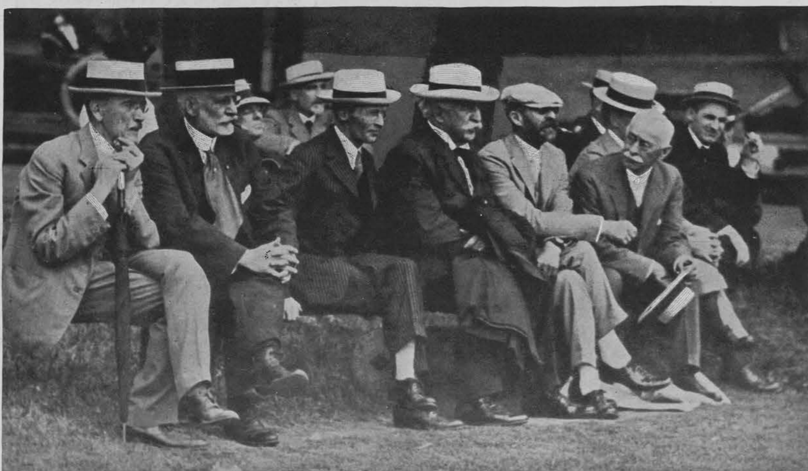
GENERAL NELSON A. MILES, U. S. A., RETIRED, (FOURTH FROM THE LEFT) AND A PARTY OF FRIENDS, INTERESTED SPECTATORS AT THE MASSACHUSETTS STATE GOLF CHAMPIONSHIP CONTEST, WON BY OUMET.