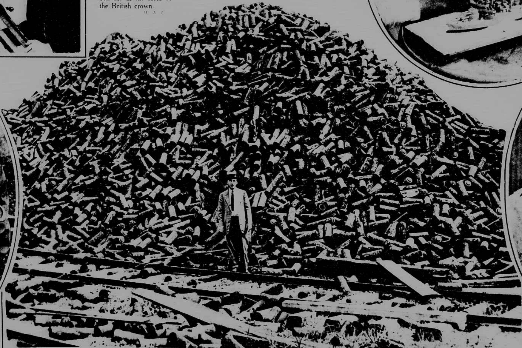
Talk about shell games! Here's a pile of shells that cost the British government $25 each. An enterprising Philadelphian woke up early one morning lately and acenting a bargain, managed to buy them for 60 cents apiece. Now that shell cocktail shakers have gone out of vogue, wonder will he convert them into rolling pins.