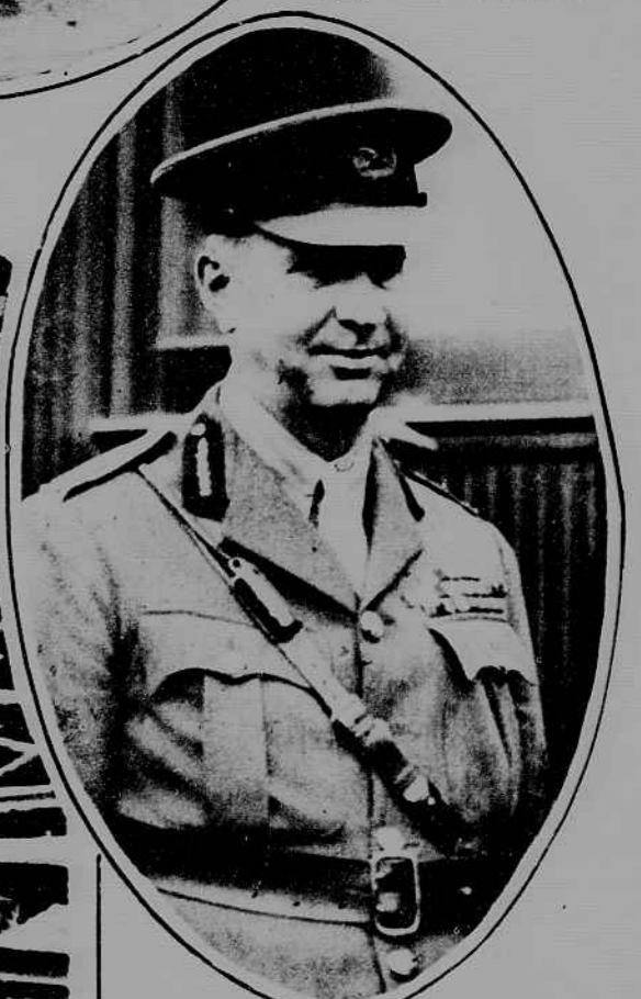
General Sir Arthur Currie, commander of the Canadian army in the Great War, photographed as he arrived at Halifax on his way home. Halifax, Montreal and Ottawa gave him the heartiest of welcomes.