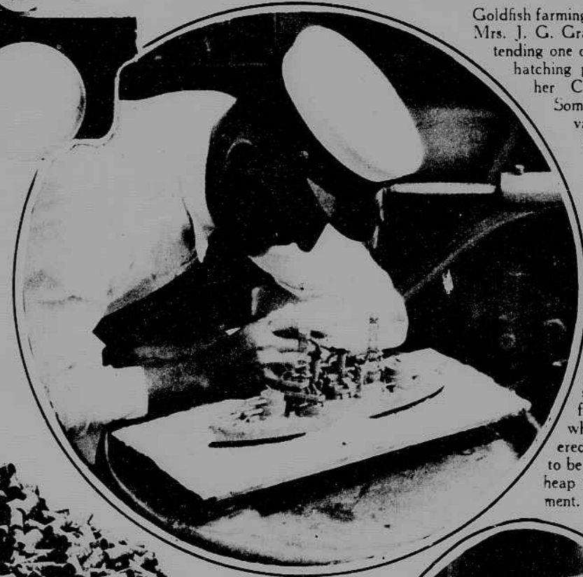
Left—This petty officer of the U. S. S. Kentucky is putting the finishing touches on a perfect scale model of that famous battleship, which is now considered obsolete and is soon to be delegated to the junk heap by the Navy Department.