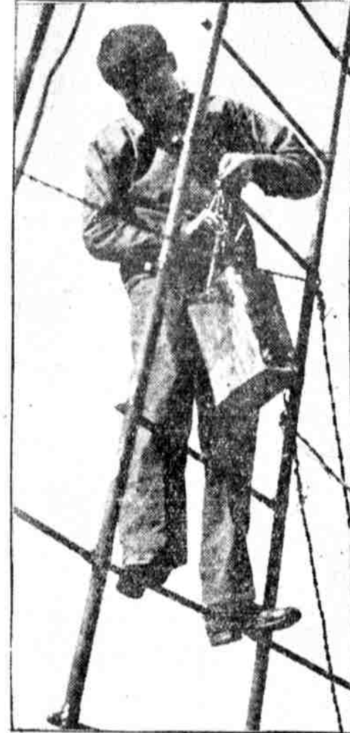
TARRING. A crew of the schoolship Annapolis, now tied up at the Philadelphia Navy Yard, assisting in the spring cleaning of the ship.