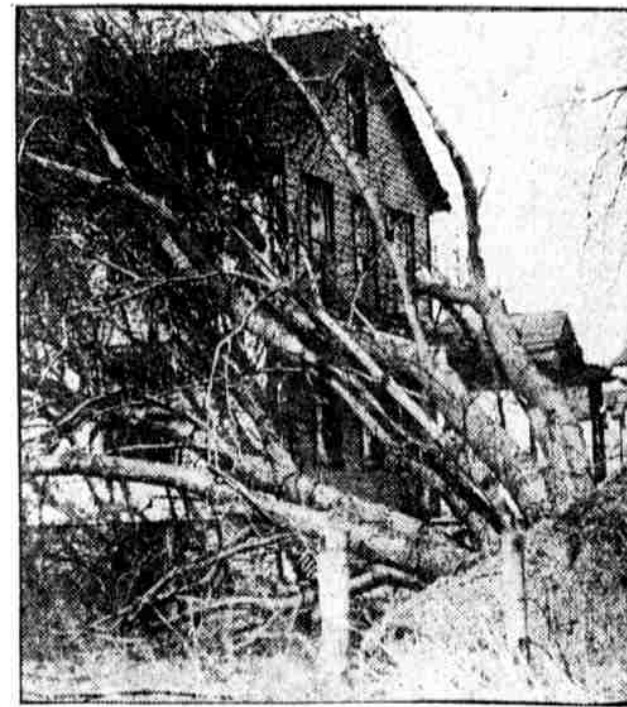
See above caption for context.