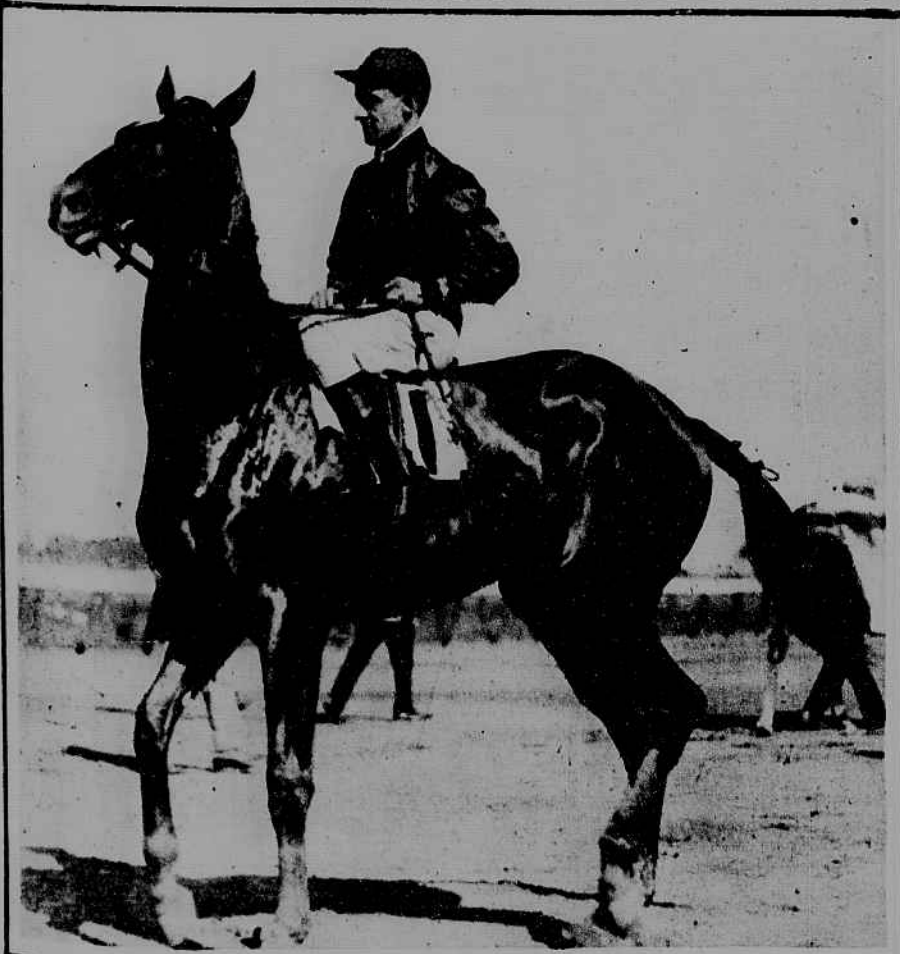
Man o' War, one of the greatest horses ever developed in this country, just after winning the rich Futurity at Belmont Park a week ago yesterday. A great crowd saw Jockey Johnny Loftus bring Man o' War home an easy winner.