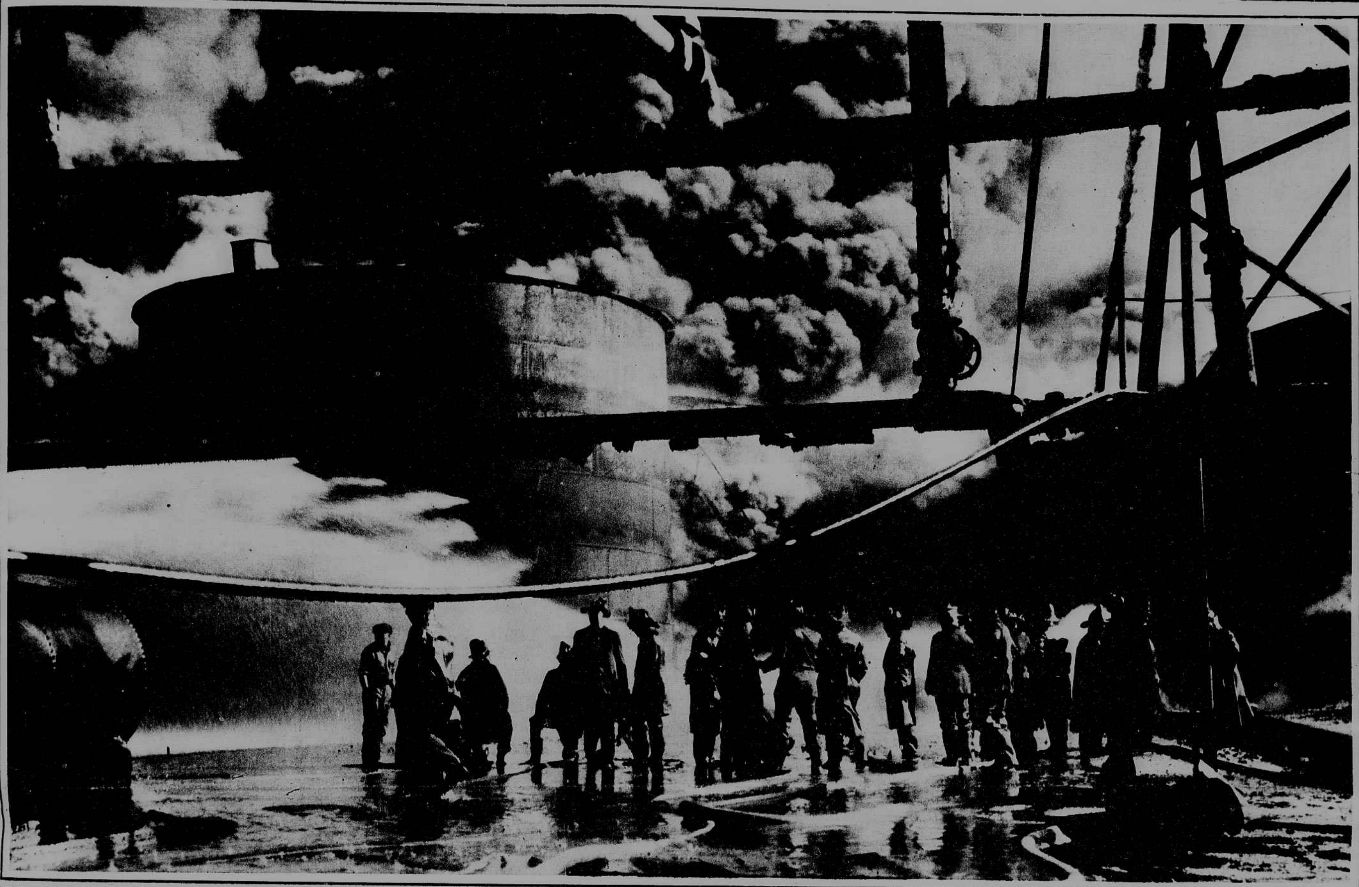
The greatest fire New York City has ever known—the refinery of the Standard Oil Company at Greenpoint, Brooklyn—that burned furiously for three days, destroyed millions of gallons of oil and caused damage estimated at $5,000,000. Over 1,000 firemen fought the spectacular blaze—300 were treated for burns and minor injuries. Left —Ambulance surgeons with the aid of a pulmotor resuscitate a fireman overcome by smoke. Right —A fireman utterly exhausted after his all night battle with the flames falls asleep on a pile of hose. The fire but gave added proof of the wonderful ability, endurance, courage and heroism of New York's fire fighters.