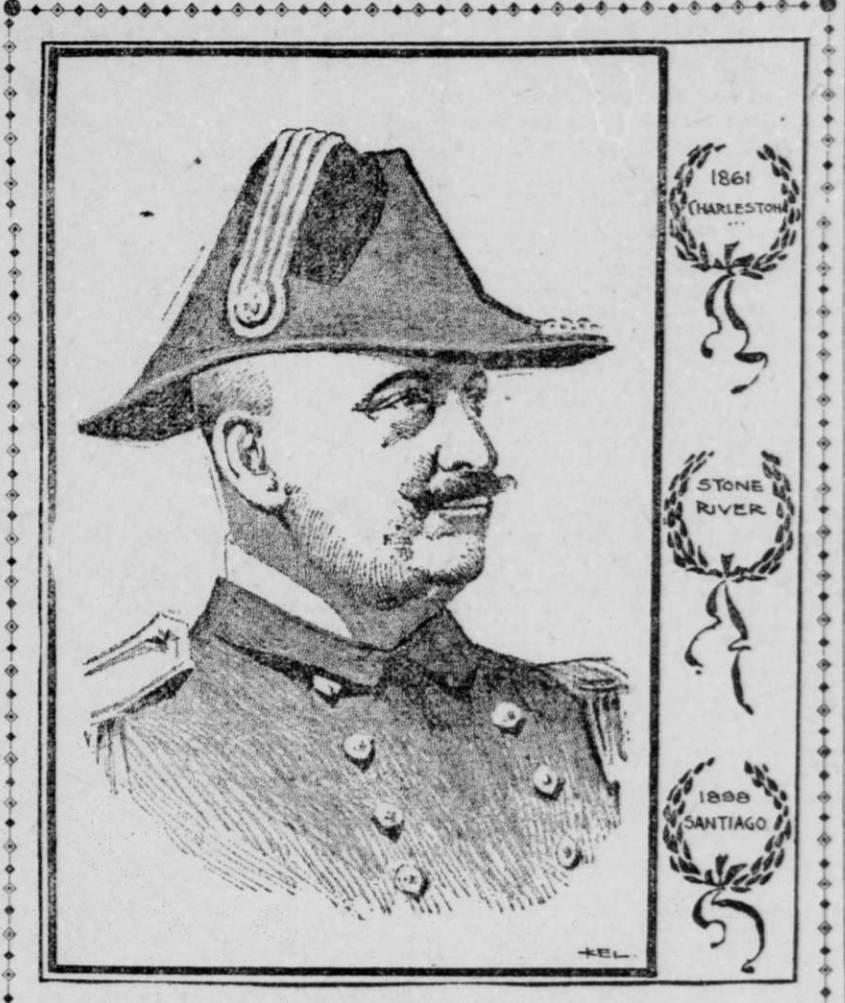
THE LATE REAR ADMIRAL JOHN WOODWARD PHILIP.

Had an Unblemished Sea Record and Did Gallant Service in Two Wars.