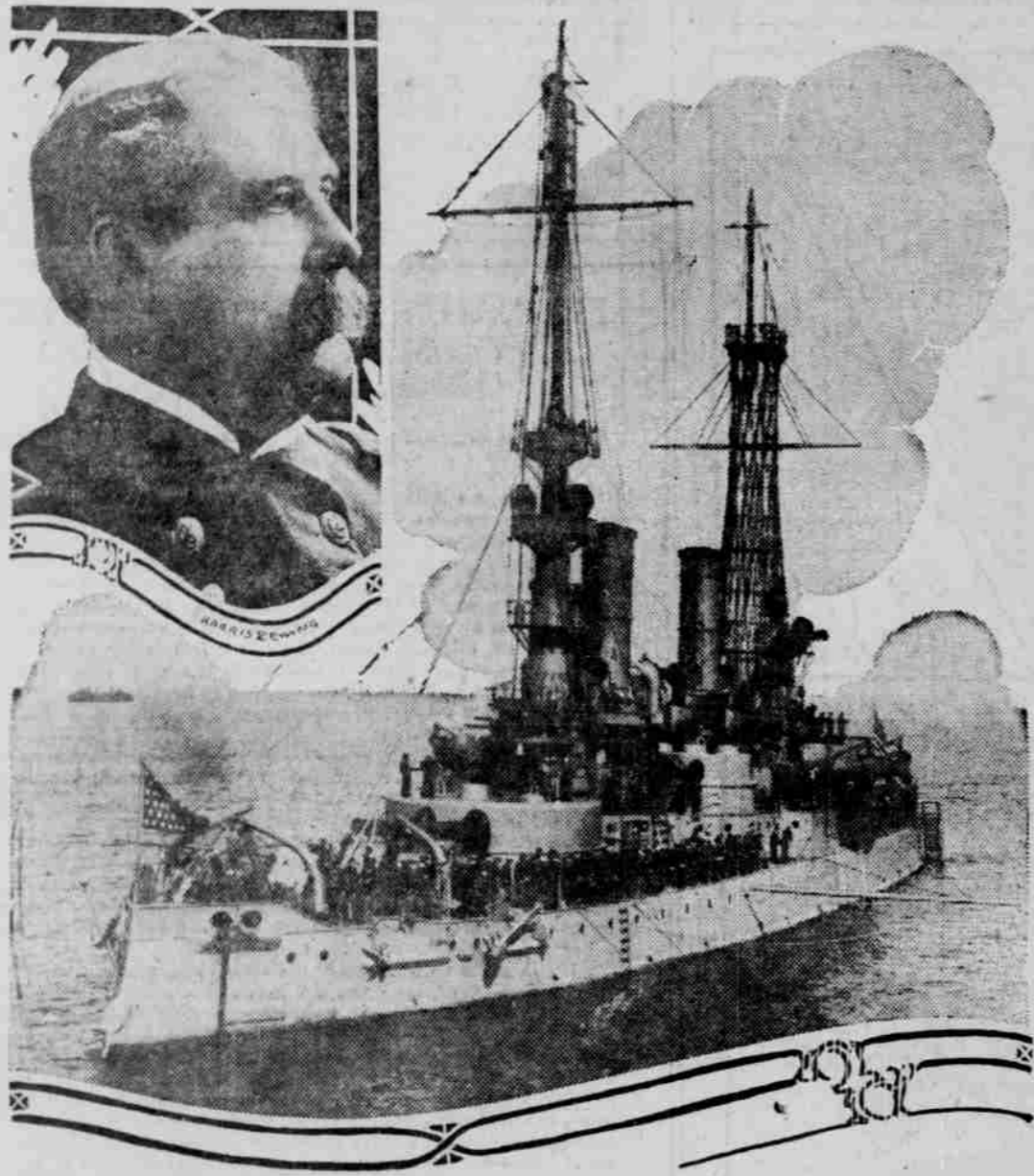
Battleship Oregon and Rear Admiral Charles E. Clarke, who commanded her during her famous dash around Cape Horn at the opening of the Spanish-American war.

The recent announcement of Franklin D. Roosevelt, assistant secretary of the navy, that the navy department had offered the old battleship Oregon to the state