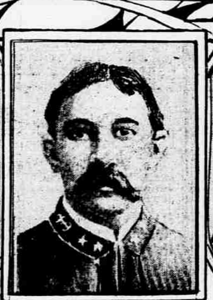
REAR ADMIRAL A.S. GROWNSFIELD