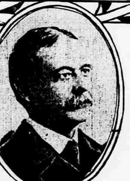
REAR ADMIRAL F.J. HIGGINSON