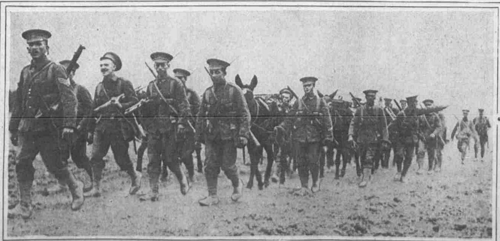
TYPICAL BRITISH "TOMMIES," WITH MACHINE GUN, ON MARCH IN FLANDERS