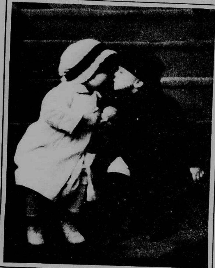
Left—"In the spring a young man's fancy," etc.—our photographer shamelessly snaps a pair of Gotham youthful lovers as they bill and coo on somebody's front stoop somewhere in Yorkville.