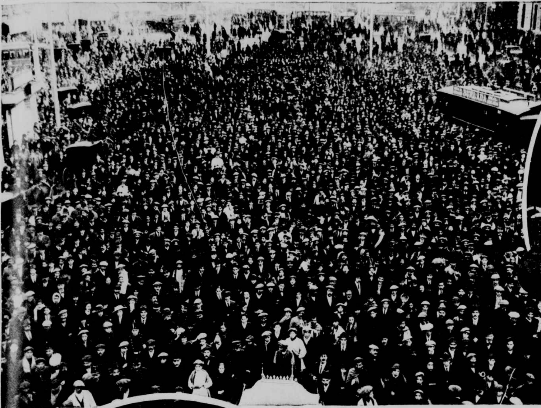
Spain's national gamble. Thousands in Madrid awaiting the announcement of the winning number in the national lottery. The grand prize is 6,000,000 pesetas, about $1,200,000 in United States money.