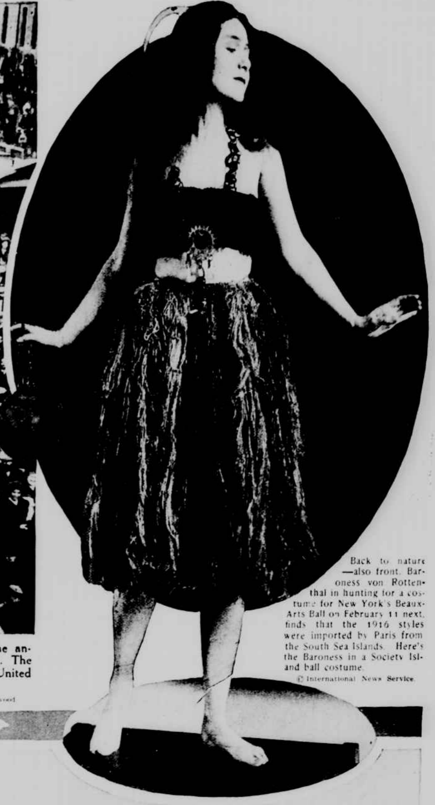
Back to nature —also front. Baroness von Rottenthal in hunting for a costume for New York's Beau-Arts Ball on February 11 next, finds that the 1916 styles were imported by Paris from the South Sea Islands. Here's the Baroness in a Society Island ball costume.