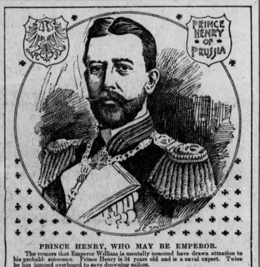
PRINCE HENRY, WHO MAY BE EMPEROR.