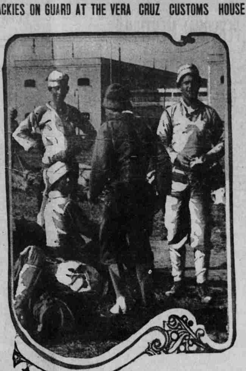
This photograph, one of the first to arrive from the scene of the battle at Vera Cruz, was taken immediately after Fletcher's men had taken possession of the Vera Cruz customs house.

This young woman received her tuition in Chinese literature and history from her own father, and, although some of the more conservative and