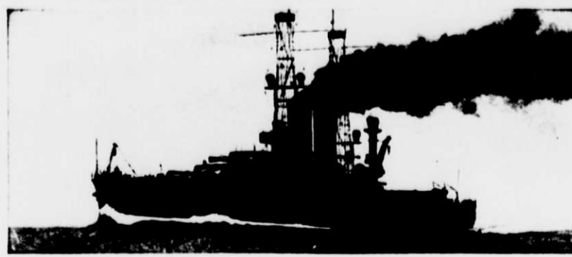
The Florida.